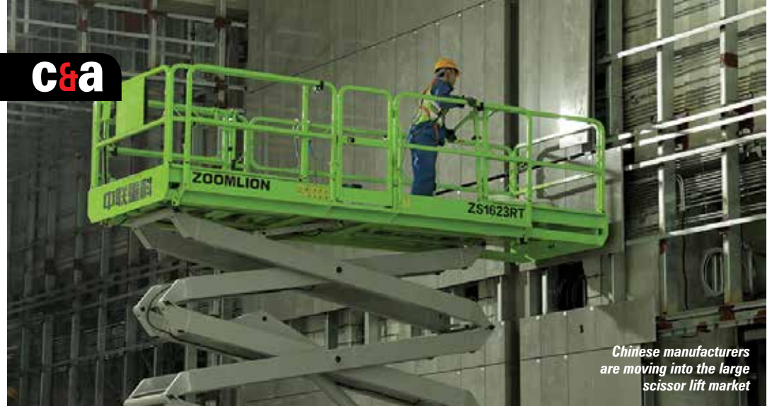
Chinese manufacturers are moving into the large scissor lift market

The growth in Chinese produced machines on the world stage is not new, but over the past 12 months it has taken on a new and surprising turn, with European and North American buyers now beginning to take larger models. The received