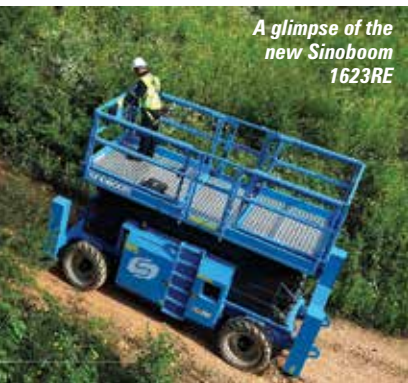
A glimpse of the new Sinoboorm 1623RE

China's Sinoboorm is planning to launch an all new 53ft 1623 full size Rough Terrain scissor lift this autumn, with a choice if either 'RD' diesel or 'RE' battery electric power. The new machine features an 18 metre working height with 680kg/ four persons platform capacity and 4x4 AC electric wheel motor drive. Details of the new machine have not yet been released, but we do have the basic specifications. The chart below compares the new machine with the some of the leading Rough Terrains already on the market.