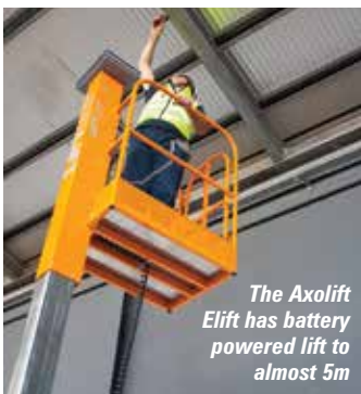
The Axolift Elift has battery powered lift to almost 5m

At first glance you might think 'Power Towers Pecolift/Ecolift copy!' does that mean patent or copyright issues? This is not the case, the Manulift uses a different internal lift mechanism that does not involve a gas spring, just a few more turns of the crank. In fact, the company has taken out two of its own patents on the new products, with further models planned. Here is how these two compare with the JLG equivalents.