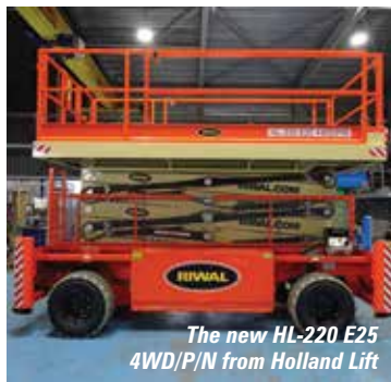
The new HL-220 E25 4WD/P/N from Holland Lift

Holland Lift has been working on a number of new models and adding updates to its range. The company may unveil some of these at Vertikal Days, along with a new distributor, but is keeping tight lipped about them. One thing it has stressed however is that it will maintain its current electro/hydraulic drive train on at least its larger models. On the new development front, it mentioned electric versions of its 65ft/2.5 metre wide Rough Terrain model, which becomes the HL-220 E25 4WD/P/N with 750kg platform capacity, and the 82ft HL-275 E25 4WD/P/N with 1,000kg platform capacity.