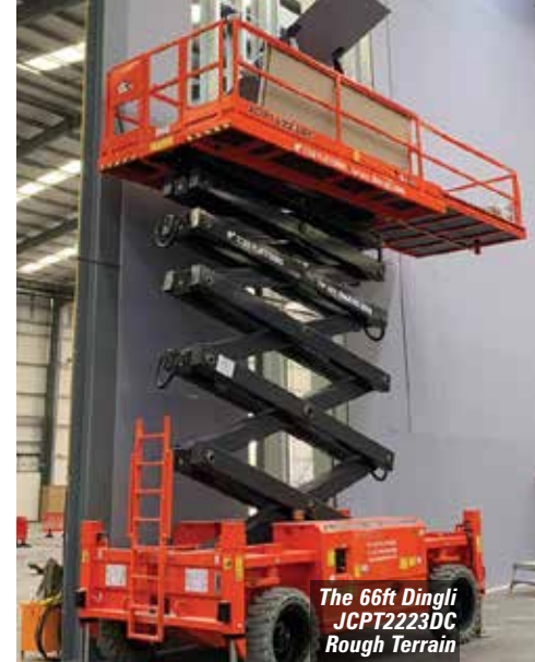
The 66ft Dingli JCPT2223DC Rough Terrain