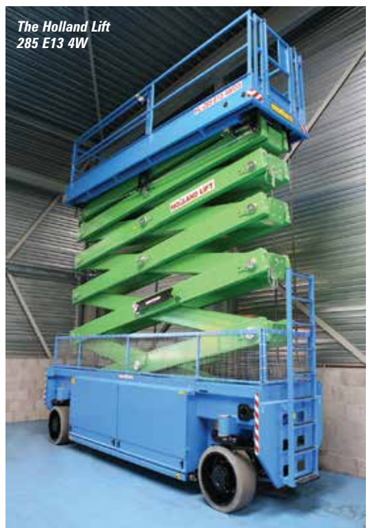
The Holland Lift 285 E13 4W

One major difference though is the drive train, Holland Lift prefers to stay with full traction lead acid battery packs and hydraulic wheel motors. The company says that the power draw required by the four electric wheel motors on such a heavy machine – they weigh more than 20 tonnes – can cause complications and battery life issues, thus the need for lithium batteries and 80 volt system. The lithium battery pack is also much lighter and requires additional counterweight to compensate, but this can be added at the lowest point of the machine, which might have some centre of gravity benefits? Holland Lift and some other manufacturers, such as Snorkel, cite the additional