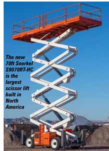
The new 70ft Snorkel S9070RT-HC is the largest scissor lift built in North America

Snorkel unveiled prototypes of two new top of the range full size plus Rough Terrain scissor lifts at Conexpo last year, the 56ft S9056RT-HC and the 70ft S9070RT-HC with high platform capacities. The S9056 offers a platform capacity of 1,134kg and a working height of 19.1 metres, while its 70ft big brother has a generous 907kg with a working height of 23.3 metres. Not only do these new machines offer big capacities, but the dual deck option provides an extended platform of 8.23 metres. Despite this, the big units have stowed dimensions that are not too dissimilar to the regular 53ft machines, with an overall length of 4.87 metres, an overall width of 2.28 metres and an overall height of 3.09 metres folding to 2.1 metres. Maximum drive height is 13.1 metres, but they are of course considerably heavier - you cannot escape physics - at 9,030kg and 11,600kg respectively. The units have a very high standard specification and are now ready for delivery.