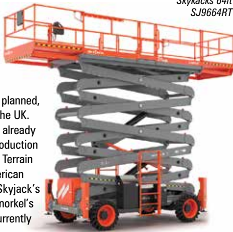
Skyjacks 64ft SJ9664RT

The first units of Dingli's new narrow machines have already left the factory for European destinations and will be available for sale in the fourth quarter. The following charts show how the new models stack up against the existing products.