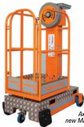
Axolift's new Manulift

From the sublime to the ridiculous perhaps? We take a brief look at an all new entrant to the low level market, the Italian built AxoLift, which goes head to head with JLG's Pecolift/Ecolift products. OK it is not a scissor lift, but most type lifts along with scissors simply go up and down, so whether the lift has a scissor stack, a sigma lift mechanism or a mast, it does exactly the same job.