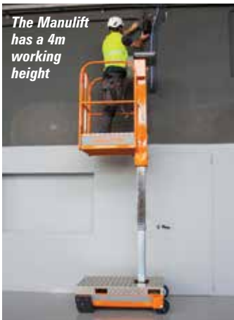
The Manulift has a 4m working height

AxoLift is the brand adopted by well established northern Italian fabrication company Gromet. The family owned company has traditionally made fabrications for others and as such is equipped with the latest cutting, bending, and robot welding equipment, allowing it to produce a high percentage of its new lifts in house – a distinct advantage in these times of supply issue challenges. The company has set up a dedicated assembly and testing facility for the AxoLift products on the other side of its home town of Veneto, northern Italy and is now launching the first two models, the manually operated Manulift and battery powered push around eLift.