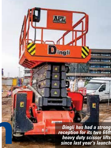
Dingli has had a strong reception for its two 66ft heavy duty scissor lifts since last year's launch

The new machines share the 4x4 AC electric wheel motor drive, as well as four wheel steer, standard levelling jacks and the ability to drive at full height. However make no mistake, as with all other products of this type, these are slab machines – not Rough Terrain, in spite of the 4x4 drive. The