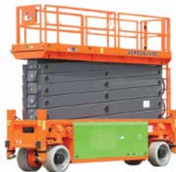
The new 86ft Dingli JCPT2814DC

new models use an 80 volt/520Ah lithium-ion battery pack, rather than the 48 volt/620Ah full traction lead acid battery pack on the company's 22 metre models. The pack is said to be good for a full shift and then some. Gradeability is 25 percent, and the units need to be within one percent of level in order to elevate the platform.