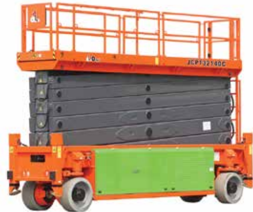
Dingli is leading the charge in the 'ultra scissor' lift market

The change has probably been spurred on by traditionally long lead times from the market leaders, coupled with the spike in demand. This spike has been fuelled in part by the growth in the construction of high stack warehouses, driven by