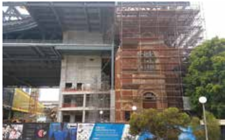
A man fell seven metres through a roof at the WA Museum in Australia

WorkSafe western Australia commissioner Darren Kavanagh said: "All the equipment necessary to create a suitable fall injury prevention system was on site, along with a licenced rigger with specific expertise in creating these systems, and all roof plumbers had access to safety harnesses. Despite having controls available, no system was in place and this worker had a devastating fall."