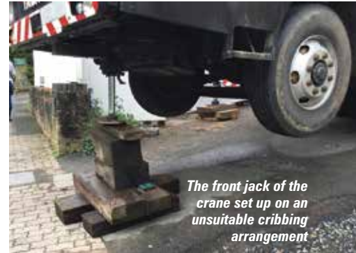
The front jack of the crane set up on an unsuitable cribbing arrangement