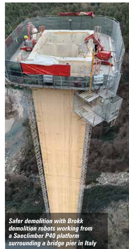
Safer demolition with Brokk demolition robots working from a Saeclimber P40 platform surrounding a bridge pier in Italy