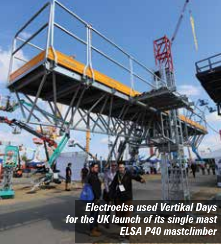
Electroelsa used Vertikal Days for the UK launch of its single mast ELSA P40 mastclimber