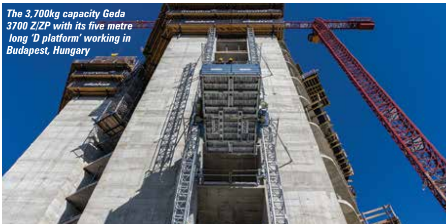
The 3,700kg capacity Geda 3700 Z/ZP with its five metre long 'D platform' working in Budapest, Hungary

The 3,700kg capacity 3700 Z/ZP is particularly interesting because it has been installed with a five metre long 'D platform', which enables the transport platform to safely carry the many glass panels that make up most of the façade of the distinctive building that will be known as the MOL Campus.