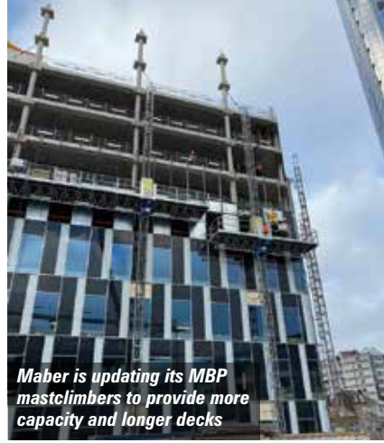
Maber is updating its MBP mastclimbers to provide more capacity and longer decks