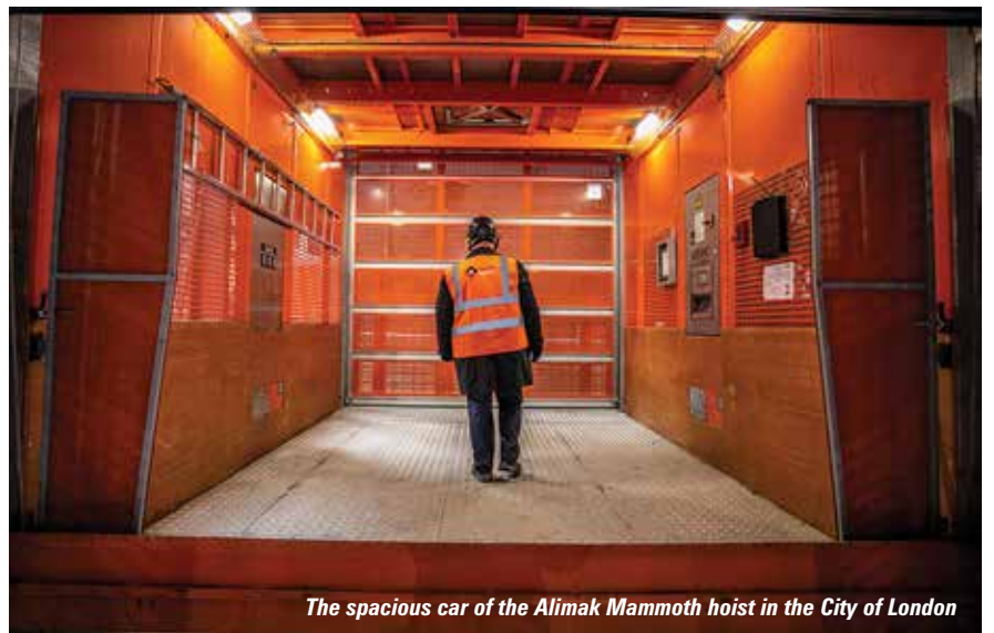
The spacious car of the Alimak Mammoth hoist in the City of London

A number of Alimak's Mammoth hoists are now being used in London. Taylors Hoists has supplied a new 4,000kg capacity