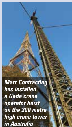
Marr Contracting has installed a Geda crane operator hoist on the 200 metre high crane tower in Australia