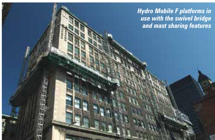
Hydro Mobile F platforms in use with the swivel bridge and mast sharing features

PHD conceptualised and created a bespoke dual platform rack and pinion traveller able to travel on a 60 metre track on a 30 degree incline within the escalator shaft. PHD's engineers worked with mastclimber maker Encomat to build a special frame around suitable drive units. Once in operation, it proved to be much quicker than the conventional methods of scaffolding, chain hoists, slings and all the manual effort that was originally envisaged.