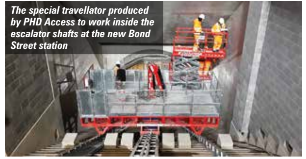
The special traveller produced by PHD Access to work inside the escalator shafts at the new Bond Street station