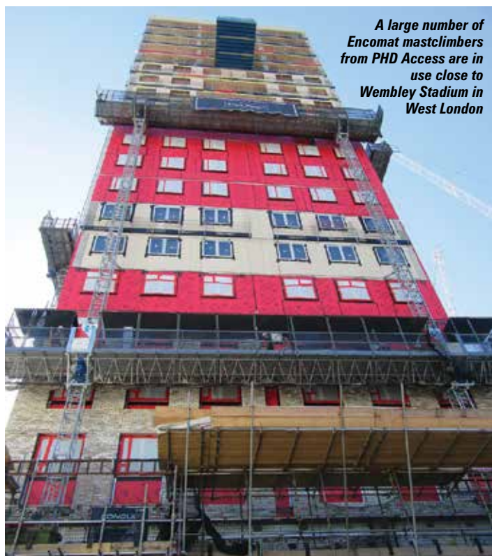
A large number of Encomat mastclimbers from PHD Access are in use close to Wembley Stadium in West London