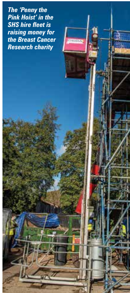
The 'Penny the Pink Hoist' in the SHS hire fleet is raising money for the Breast Cancer Research charity

A very visible unit in the Southern Hoist fleet is 'Penny the Pink Hoist', a Geda 300Z goods hoist resplendent in a bright pink livery. It was commissioned late last year as part of Breast Cancer Awareness month and 20 percent of the rental revenue is donated to the Breast Cancer Research charity.