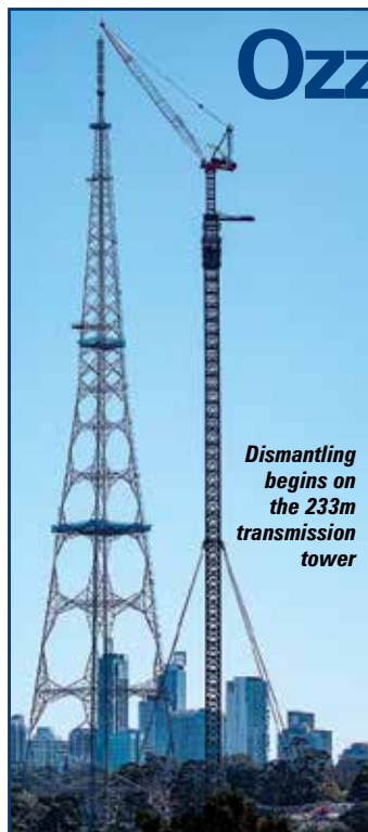
Dismantling begins on the 233m transmission tower

Marr Contracting - well known for its big Favelle Favco cranes - has been commissioned to provide the mechanical muscle needed to remove the structure, which is as high as a 77 storey building. Marr has installed one of its M310D luffing jib tower cranes on a 200 metre freestanding tower supported half way up by guy ropes.