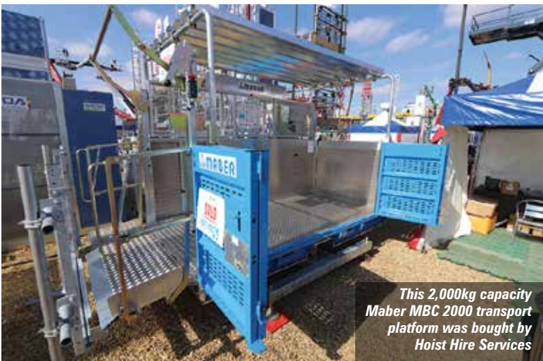
This 2,000kg capacity Maber MBC 2000 transport platform was bought by Hoist Hire Services