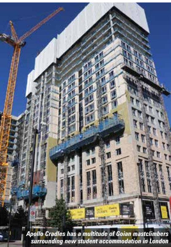
Apollo Cradles has a multitude of Goian mastclimbers surrounding new student accommodation in London

Another prominent supplier of mastclimbers in London is PHD Access. It has multiple Encomat models, including single and double mast and double stacked units, working close to Wembley Stadium in West London. There are around 60 mastclimber drive units on the Wembley Park development being built by McLaren Construction.