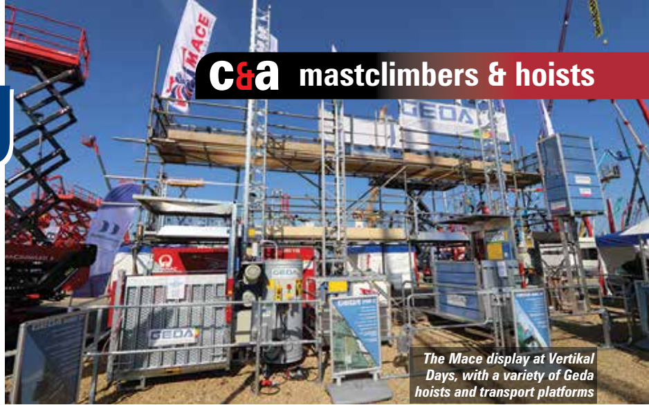
The Mace display at Vertical Days, with a variety of Geda hoists and transport platforms

Nick Johnson takes a look at the latest hoist developments and discovers a buoyant UK market for both construction hoists and mast climbing transport platforms with a growing trend towards bigger units.