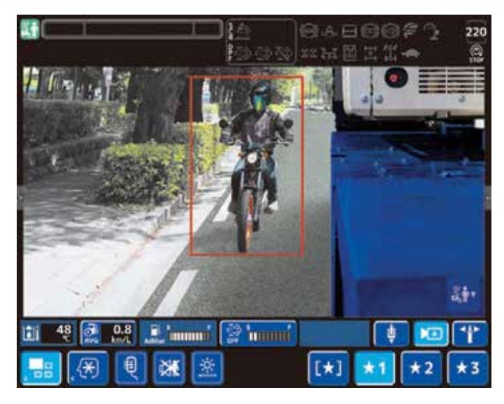
The in cab display screen during road travel