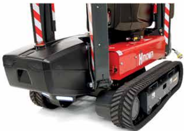
OUTRIGGER PADS HOLDER AND LED FRONT AND REAR WORKING LIGHTS