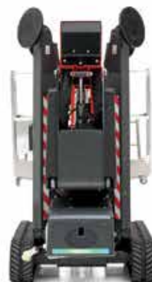
LITHIUM-ION BATTERY ELECTRIC DRIVE TRACKS

LITHIUM-ION SYSTEM 52V / 80AH WORKING HEIGHT 13M HORIZONTAL OUTREACH 6,4M UNDERCARRIAGE WIDTH OPEN/CLOSE 75 / 110 CM