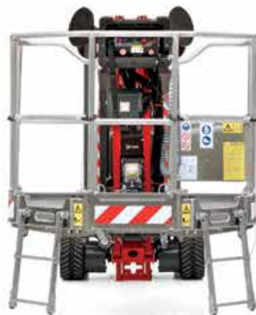
NEW DSE DUAL SIDE ENTRY BASKET WITH MESH FLOOR