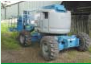
SELF PROPELLED TELESCOPIC PLATFORM 2002 GENIE Z45/22 4x4 15m. working height (46ft). Oscillating axle. Deutz Diesel. Choice of 5 machines.