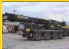
Liebherr LTM1070-1 Year 1994. Capacity 70 tonnes. All Terrain