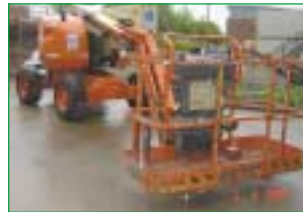
SELF PROPELLED TELESCOPIC PLATFORM 2000 JLG 450AJ 15m. working height (51ft.). Deutz Diesel. Choice of several machines.