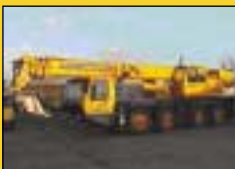
Grove KMK4070 Year 1996. Capacity 70 tonnes. All Terrain