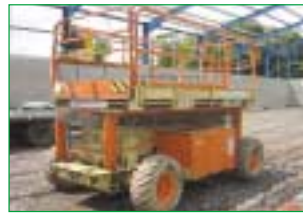
SELF PROPELLED SCISSOR PLATFORM 1999 JLG 33 RTS 12m. working height (39ft). Deutz Diesel. Choice of several machines.