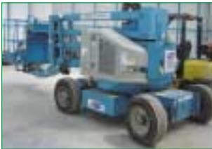
3SELF PROPELLED TELESCOPIC PLATFORM 1998 GENIE Z45/22. Bi-fuel 15m. working height (50ft.). Kubota Diesel & D.C. Battery Power. Choice of several machines.