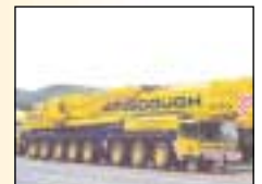
Liebherr LTM1400 Year 1998. Capacity 400 tonnes. All Terrain