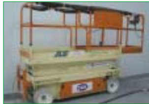
SELF PROPELLED SCISSOR PLATFORMS 1998 JLG 2033E. 8m. working height (26ft). Battery/Electric. Choice of machines.