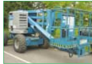
SELF PROPELLED TELESCOPIC PLATFORM 1998 GENIE Z45/22 15m. working height (50ft.). Deutz Diesel Choice of 20 machines.