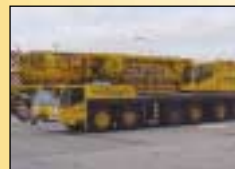
Demac AC300 Year 1999. Capacity 300 tonnes. All Terrain