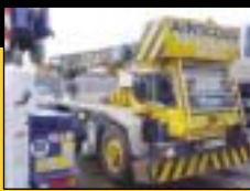
Grove AP415 Year 1996. Capacity 15 tonnes. Industrial Crane

Used Cranes for Sale Direct from the UK's largest Crane Hirer Visit our Website: www.ainscough.co.uk