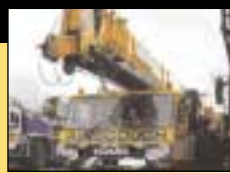
Tadano TG500E Year 1996/98. Capacity 50 tonnes. Truck Crane