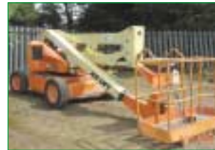
SELF PROPELLED TELESCOPIC PLATFORM 1998 JLG 45DC 15m. working height (50ft.). D.C. Battery Powered Choice of several machines.