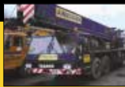
Tadano TL350E Year 1996. Capacity 35 tonnes. Truck Crane