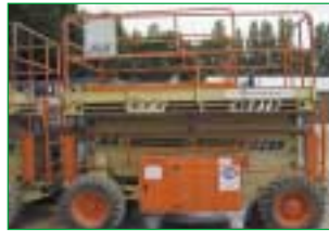
SELF PROPELLED SCISSOR PLATFORM 1998 JLG 40RTS. 14m. working height (46ft). Deutz diesel. Choice of machines.