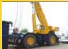
Grove RT980 Year 1981. Capacity 73 tonnes. Rough Terrain.