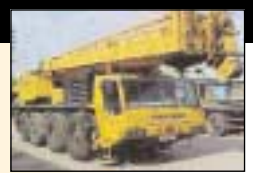
Faun ATF70-4 Year 1993/96. Capacity 70 tonnes. All Terrain