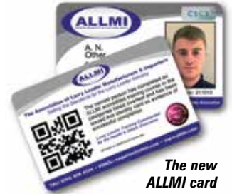
The new ALLMI card

For further information, please contact ALLMI, and visit cscs.uk.com/smartcheck for details of the wider CSCS Smart Check initiative.