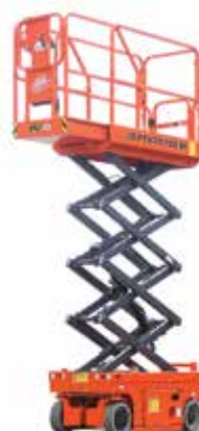
The 15ft JCPT0707DCM

Platform capacity is 135kg plus 90kg on the load platform going up, 115kg when coming down. Drive comes from two electric wheel motors with a maximum travel speed of 4.8kph. The overall length of the new machine is 1.59 metres, overall width 750mm and stowed height 1.59 metres. Total weight is 640kg.