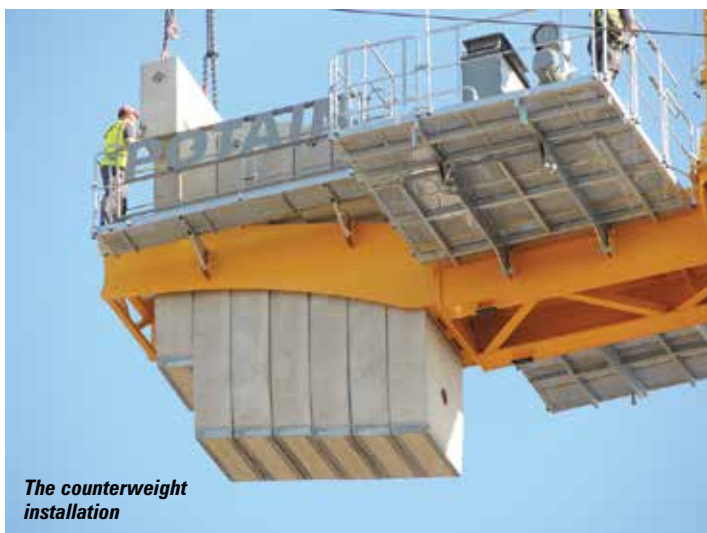
The counterweight installation

The company says that while it is an 800 tonne/metre crane, it transports and can be erected as easily as 450 tonne/metre cranes and set up twice as fast and with less space than conventional 40 tonne tower cranes. For example, it can be assembled to a 50 metre lifting height and full 80 metre jib in less than three days.