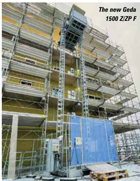
The new Geda 1500 Z/ZP F

German hoist manufacturer Geda has launched the new 1500 Z/ZP F - a free-standing version of the 1500 Z/ZP - able to operate as a material or passenger hoist to free-standing heights of up to 12 metres saving time on drilling and filling anchor points, although it can be built to 100 metres when anchored. The hoist features a 1.45 x 3.3 metre loading platform with a lift capacity of up to 1,300kg or seven people.