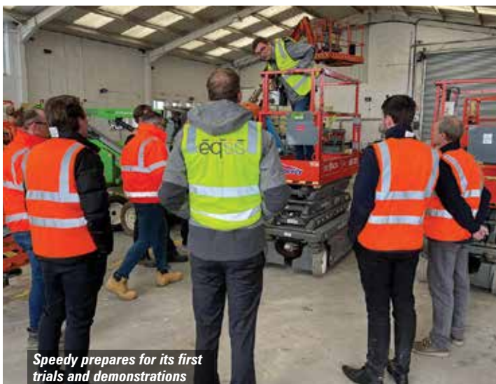
Speedy prepares for its first trials and demonstrations