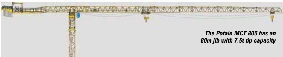
The Potain MCT 805 has an 80m jib with 7.5t tip capacity