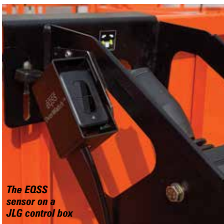
The EQSS sensor on a JLG control box

The system analyses the operator's position and movement in relation to the motion of the scissor lift. It can then determine when an operator has moved abruptly or is in a dangerous position, either of which will immediately stop the machine usually without using the operator as a mechanical element to trigger the anti-crush device. The first European units are undergoing trials in the UK.