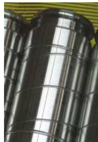
Holland Lift takes no chances and supplies Scissor Arm Pivot Pins with dual lubrication tracks (right). The pins also sit inside substantial bushes which in turn sit inside heavy duty collars (left).