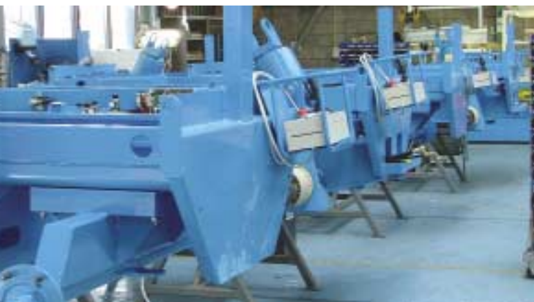
At its main Hoorn facility in The Netherlands, Holland Lift produces units with platform heights over 20 metres, the tallest being over 30, as well as big narrow aisle scissors and big high-capacity models.