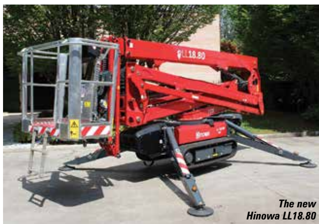
The new Hinowa LL18.80