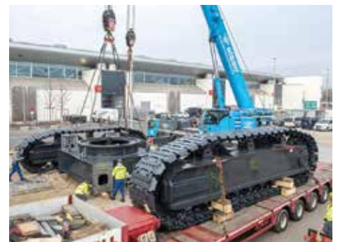
Few shows justify the cost of showing the biggest cranes

While the big western self-propelled manufacturers are giving the show a miss this year, many other companies will be present including the major Chinese producers such as Dingli, Sinoboom, Zoomlion, XCMG, and many smaller European manufacturers including Holland Lift, Dinolift and Leguan. If truck mounted lifts are more of an interest for you, then things look even brighter with major players such as Ruthmann, Bronto Skylift, Palfinger, Multitel Pagliero, GSR, CTE and Klubb will all be present. Spider lifts will also be well represented with new models from CMC, Hinowa, Platform Basket, CTE, Easy Lift and others.