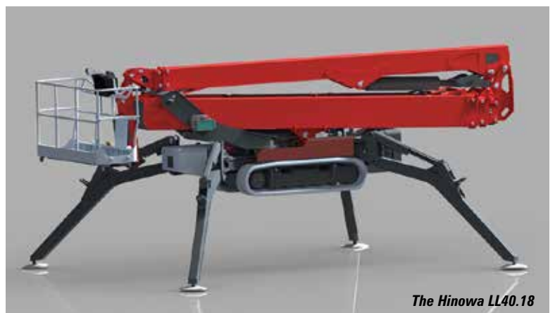
The Hinowa LL40.18