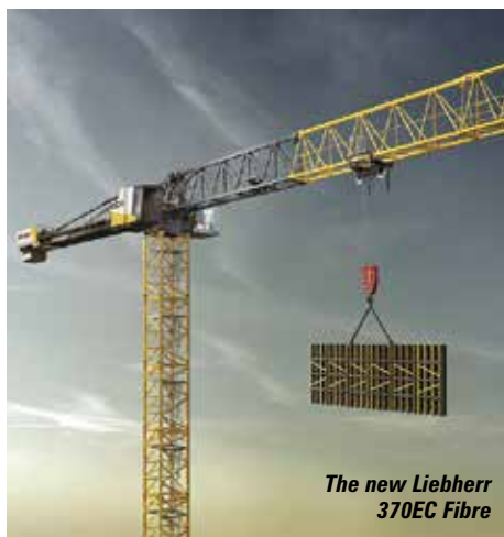
The new Liebherr 370EC Fibre

The biggest stand on the show will be packed full of innovations, prototypes and new concepts. The stand out new product will be the 2,500 tonne crawler crane - the first in a new breed of big cranes. It will also have further Unplugged electric crawler cranes, and an all-new hydraulic luffing jib tower crane. While it is one of the last manufacturers to enter this market, it promises to be a head turner, given that it has absorbed all the efforts that others have made over the past 20 years. Liebherr is not providing photos or sketches of the new crane until the show opens, or just before. Perhaps we will have more to report on in the next issue?