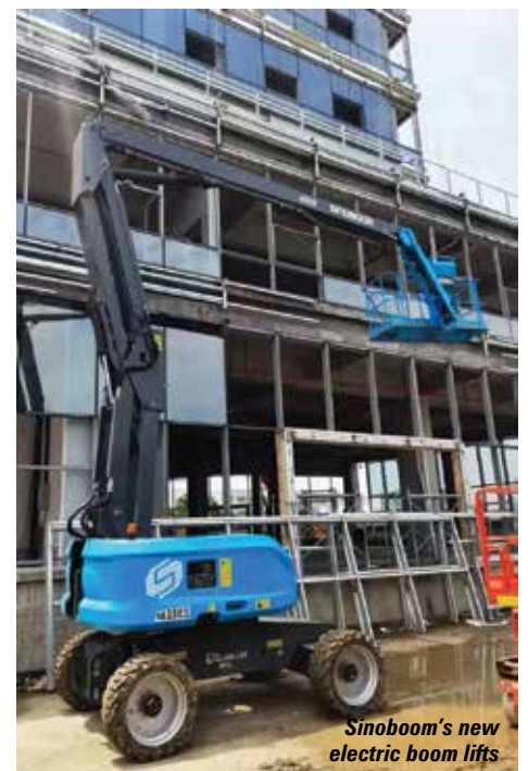
Sinoboom's new electric boom lifts

Chinese manufacturer Sinoboom will be focused on its programme to build CE aerial lift models in Europe. The company began assembling scissor lifts in Poland this year and plans to both extend the range of units and to move into full production. It will also have its new all-electric models on display, including two all-electric articulated boom lifts - the 59ft AB18 with a 20 metre working height and the 72ft AB 22RT with a 24 metres working height. Both feature dual - 230kg/450kg - platform capacities with 4x4 drive and 360 degrees continuous slew. The AB22RT also features a big basket and outperforms the diesel models. All units in the range have standard AGM battery packs with a new lithium ion option due for launch.