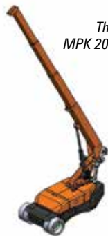
The MPK 20R

The company will also launch a new two tonne mini picker, the MPK 20R and the 990kg MPK 10 which features the same basic design as its smaller sibling - the 600kg MPK06 - with a 3.5 metre three section boom with a maximum tip height of almost 4.5 metres at which point it can lift 430kg at a maximum radius of 1.75 metres. The crane has nine degrees of slew either side of centre - 18 degrees in total.