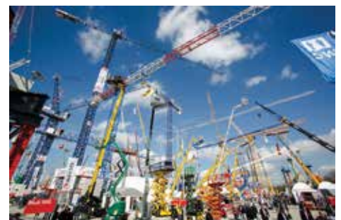
Some of the majors might be missing, but there will still be plenty of new products to see