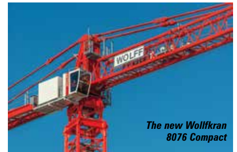
The new Wolffkran 8076 Compact

The recently launched 22 metre TC 22N and TC22S telescopics will also be on display which offer up to 12.5 metres of outreach, on the N - normal - version with an overall width of 880mm and a total weight of 3.0 to 3.1 tonnes depending on power - a choice of diesel, lithium or hybrid.