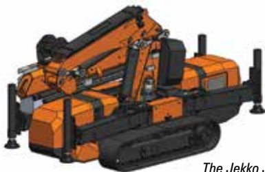
The Jekko JF235

The new JF235 adds to the lower end of the range. The 6.1 tonne bi-energy model has a maximum lift height of 15 metres and is just 4.74 long with an overall width of 1.6 metres and an overall height of 2.6 metres. It also incorporates all the new technology and controls from the SPX328.