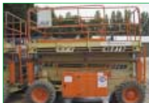
SELF PROPELLED SCISSOR PLATFORM 1998 JLG 40RTS. 14m. working height (46ft). Deutz diesel. Choice of machines.