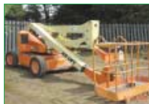
SELF PROPELLED TELESCOPIC PLATFORM 1998 JLG 45DC 15m. working height (50ft.) D.C. Battery Powered Choice of several machines.

Tel +44 (0) 1291 421155 Fax +44 (0) 1291 423930