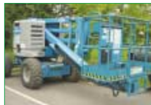
SELF PROPELLED TELESCOPIC PLATFORM 1998 GENIE Z45/22 15m. working height (50ft.). Deutz Diesel Choice of 20 machines.