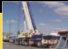
Liebherr LTM1160/2 Year 1998. Capacity 160 tonne. All Terrain.