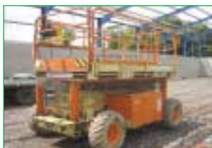
SELF PROPELLED SCISSOR PLATFORM 1999 JLG 33 RTS 12m. working height (39ft). Deutz Diesel. Choice of several machines.