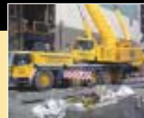
Liebherr LTM1120 Year 2001. Capacity 120 tonne. All Terrain.