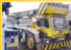
Grove AP415 Year 1996. Capacity 15 tonne. Industrial Crane.