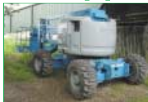
SELF PROPELLED TELESCOPIC PLATFORM 2002 GENIE Z45/22 4x4 15m. working height (46ft). Oscillating axle. Deutz Diesel. Choice of 5 machines.