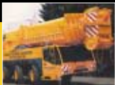
Demag AC2000 Year 1999. Capacity 800 tonne. All Terrain with full SSL.

Used Cranes for Sale Direct from the UK's largest Crane Hirer Visit our Website: www.ainscough.co.uk