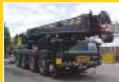
Tadano Faun ATF 70-4 Year 1996. Capacity 70 tonne. All Terrain.