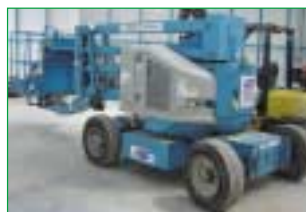
3SELF PROPELLED TELESCOPIC PLATFORM 1998 GENIE Z45/22. Bi-fuel 15m. working height (50ft.). Kubota Diesel & D.C. Battery Power. Choice of several machines.