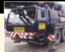
Liebherr LTM 1090/2 Year 1997. Capacity 90 tonne. All Terrain.