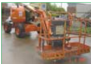
SELF PROPELLED TELESCOPIC PLATFORM 2000 JLG 450AJ 15m. working height (51ft.). Deutz Diesel. Choice of several machines.