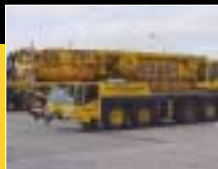
Demag AC300 Year 1999. Capacity 300 tonne. All Terrain.