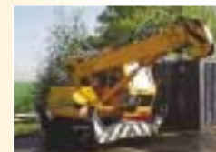
Starlifter SMC CX800 Year 1998. Capacity 8 tonne. Telescopic Crawler.