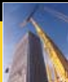
Liebherr LTM1400 Year 1998. Cap. 400 tonne. All Terrain.