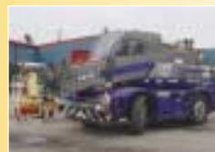
Kato CR 100 Year 1999. Capacity 10 tonne . City Crane.