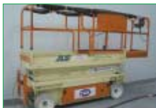
SELF PROPELLED SCISSOR PLATFORMS 1998 JLG 2033E. 8m. working height (26ft). Battery/Electric. Choice of machines.