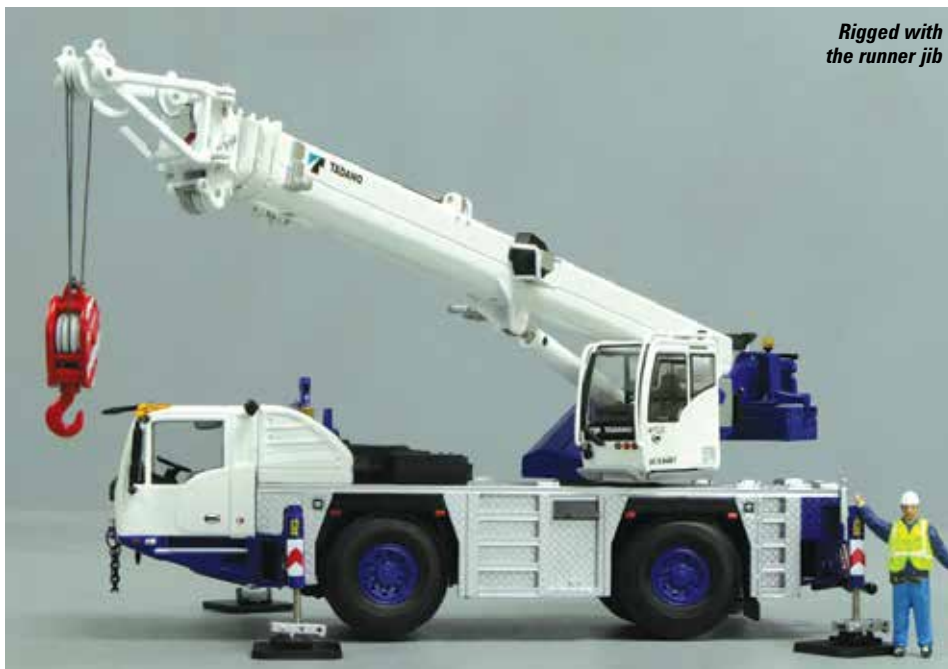
Rigged with the runner jib