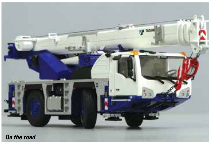
On the road