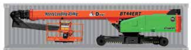
Standard Container Transport For The Full Range