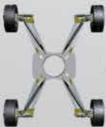
Brand New One-Key In-Situ Axle Expansion Technology Global Patent Protection