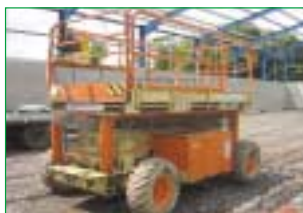
SELF PROPELLED SCISSOR PLATFORM 1999 JLG 33 RTS 12m. working height (39ft.). Deutz Diesel. Choice of several machines.