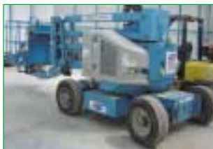
3SELF PROPELLED TELESCOPIC PLATFORM 1998 GENIE Z45/22. Bi-fuel 15m. working height (50ft.). Kubota Diesel & D.C. Battery Power. Choice of several machines.