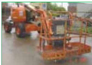
SELF PROPELLED TELESCOPIC PLATFORM 2000 JLG 450AJ 15m. working height (51ft.). Deutz Diesel. Choice of several machines.