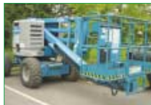
SELF PROPELLED TELESCOPIC PLATFORM 1998 GENIE Z45/22 15m. working height (50ft.). Deutz Diesel Choice of 20 machines.