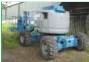
SELF PROPELLED TELESCOPIC PLATFORM 2002 GENIE Z45/22 4x4 15m. working height (46ft.). Oscillating axle. Deutz Diesel. Choice of 5 machines.