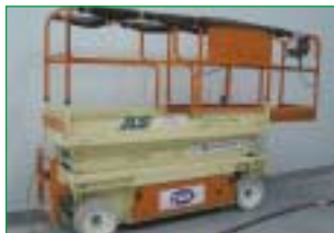
SELF PROPELLED SCISSOR PLATFORMS 1998 JLG 2033E. 8m. working height (26ft.). Battery/Electric. Choice of machines.