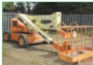
SELF PROPELLED TELESCOPIC PLATFORM 1998 JLG 45DC 15m. working height (50ft.). D.C. Battery Powered Choice of several machines.