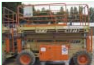
SELF PROPELLED SCISSOR PLATFORM 1998 JLG 40RTS. 14m. working height (46ft.). Deutz diesel. Choice of machines.