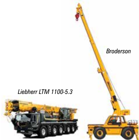
Liebherr LTM 1100-5.3