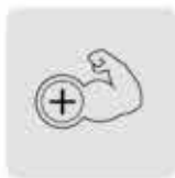
Terex Power Plus