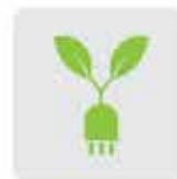
Electric by Nature