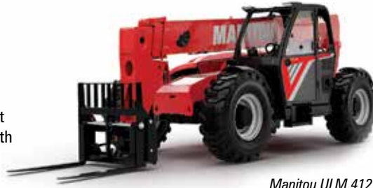
Manitou ULM 412

Merlo will highlight its all-electric compact E-Worker unit, as well as its latest Roto 360 degree models which have been recently updated. Skyjack will have a SJ519 TH compact and the 17m/56ft SJ1256 THS, both of which are now being produced at its all-new production facility in Mexico.