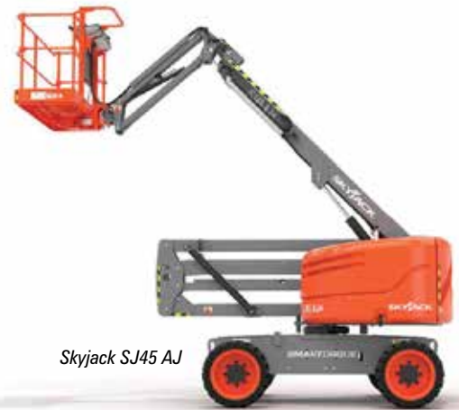
Skyjack SJ45 AJ

MEC has promised plenty of new models which it is keeping secret for now, but it will launch and all-new 85ft boom lift, its largest to date which the company says will be 'different' - possibly with electric or hybrid power. Look out also for its new 'No oil' Nano10-XD with a lithium ion battery pack and standard 'Xtra Deck'