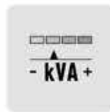
Terex Power Match