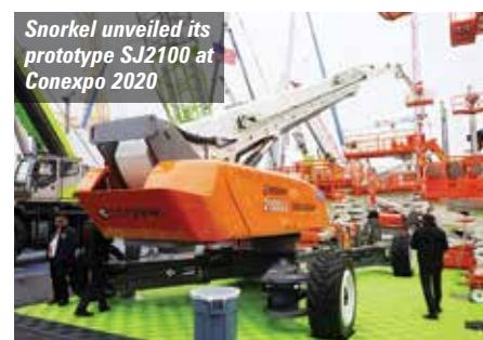
Snorkel unveiled its prototype SJ2100 at Conexpo 2020