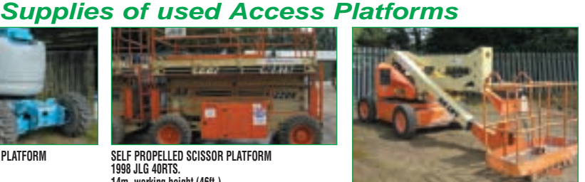
SELF PROPELLED TELESCOPIC PLATFORM 1998 JLG 45DC 15m. working height (50ft.) D.C. Battery Powered Choice of several machines