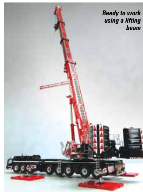
Ready to work using a lifting beam

This is a top quality model which is made well, and the Mammoet paintwork and graphics are generally excellent. It sets a very high standard for a large mobile crane model and costs €589 from the Mammoet Store.