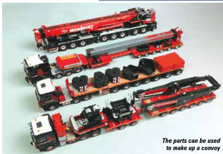
The parts can be used to make up a convoy