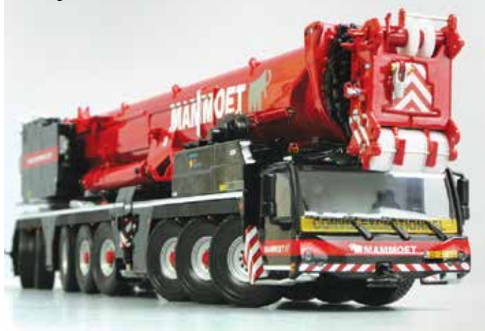
Looks great on the road