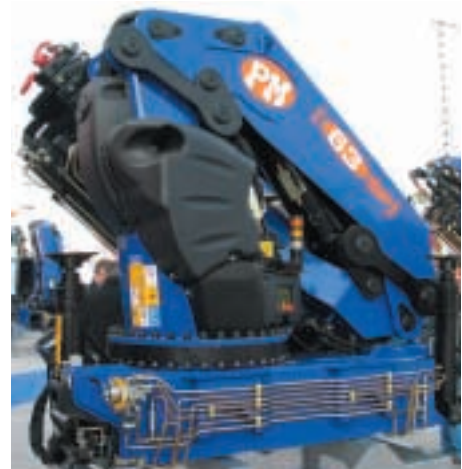
PM's new 60 t/m, nine-extension 63 SP knuckle boom capable of reaching up to 26 m with a four-extension hydraulic jib.

Bauma's organisers claim that more visitors turned up to this year's event than to any other bauma show during its 50-year history. "Just what the industry needed," said one equipment producer. C&A brings you some of the highlights.