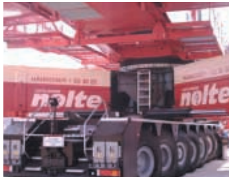
Liebherr's new 750 t capacity LTM 1750 lattice-boom mobile crane truly had to be seen to be believed. Displayed in the colours of Germany-based crane rental firm, Hans Joachim Nolte Auto-Krane, the massive unit combines a newly-developed eight-axle carrier with the upper of Liebherr's LR 1750 crawler crane.