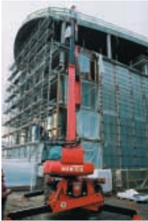
With a lift height of 24 m and a maximum reach of 18.5 m, Manitou launched its largest rotating telehandler to date, the MRT 2540.