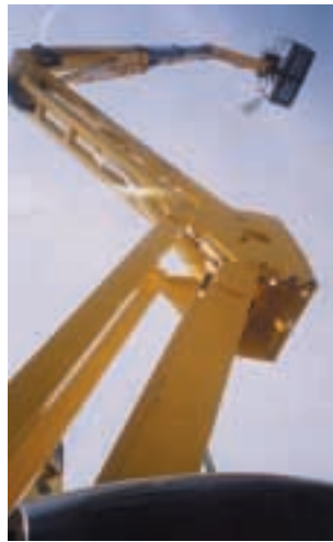
Italian aerial platform producer, Tigieffe, introduced its new 23.1 m working height rough terrain articulating boom, the Airo SG2100-JD4WD. The unit shares the same chassis as its SG21800 predecessor, but includes an additional third boom extension.

Bauma's organisers claim that more visitors turned up to this year's event than to any other bauma show during its 50-year history. "Just what the industry needed," said one equipment producer. C&A brings you some of the highlights.