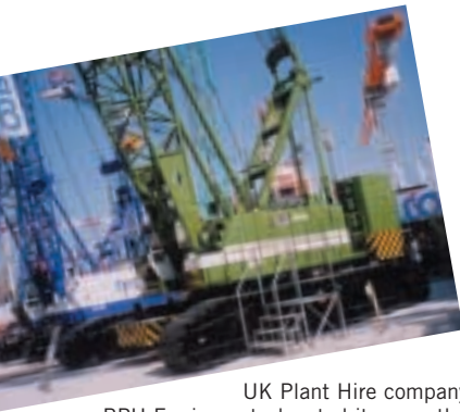
UK Plant Hire company, BPH Equipment, donated its recently purchased 135 t capacity Kobelco CKE 1350 crawler crane for display on the Keibelco stand. Kobelco's 75 t capacity BME750HD heavy-duty foundation crawler, recently sold to UK contractor, Stent Piling, could also be seen, along with one of two 80 t CKE 800 units sold to Dutch rental company, P van Adrighem, and making up part of an order with Hovago, also of The Netherlands, for 10, 250 t capacity CKE2500s.