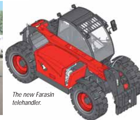
The new Farasin telehandler.