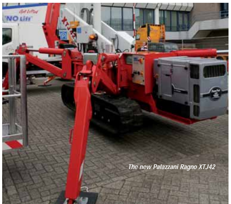
The new Palazzani Ragno XTJ42