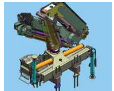
PM will unveil two models in a new crane series