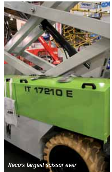
Iteco's largest scissor ever

Loader crane producer PM will unveil two models in a new crane series - the PM 15S and PM 16.5SP, with double linkages to allow jib articulation up to 15 degrees above horizontal. The company hopes that the new models will help it compete better on the world stage and feature new CanBus controls linked into a new moment control device. The cranes have also been designed for simpler installation with tilt back manual or hydraulic stabilisers with three alternate widths. All hoses, hydraulic tubes and wiring is protected with ABS covers and where possible routed internally.