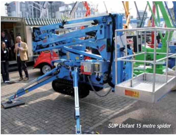
SUP Elefant 15 metre spider

The new cranes have relatively low hydraulic pressures at 295 bar, and offer up to six hydraulic extensions giving up to 23 metres of reach.