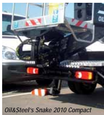
Oil&Steel's Snake 2010 Compact