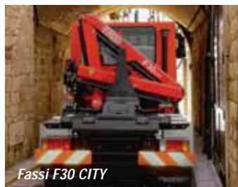
Fassi F30 CITY

The loader crane has a stowed width of just 1,600mm and can reach 6.3 metres while lifting 335kg. It can be equipped with proportional multi-function remote controls an electronic limiting