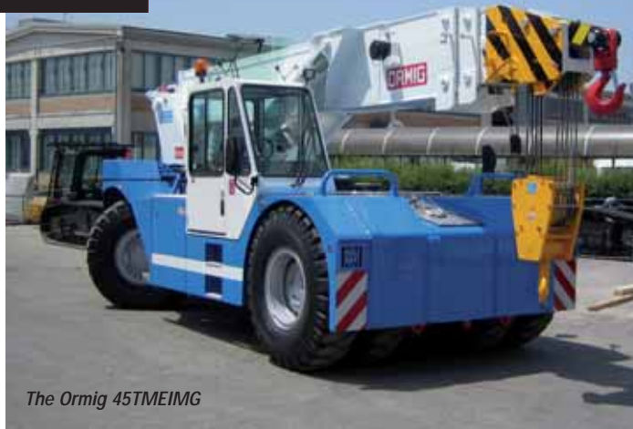
The Ormig 45TMEIMG

Deci is keeping its cards close to its chest but did tell us that it will have some important announcements at the show.