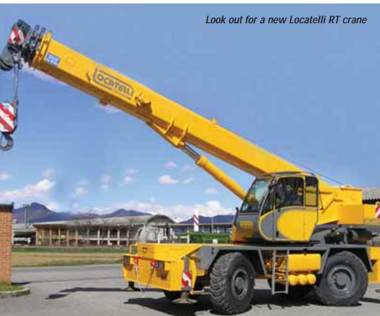
Look out for a new Locatelli RT crane

Italian industrial 'pick and carry' manufacturer Ormig, formed in 1949, will have cranes with capacities from 5.5 to 60 tonnes with a choice of diesel or electric power on its stand along with the new compact, electrically powered 45tmE crane which has a 45 tonne maximum lift capacity.