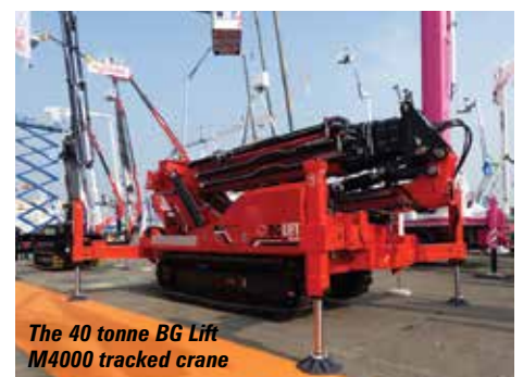
The 40 tonne BG Lift M4000 tracked crane