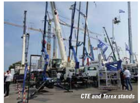
CTE and Terex stands