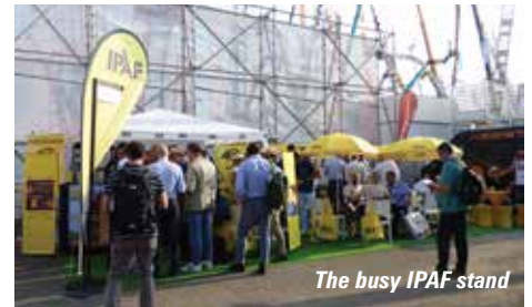
The busy IPAF stand