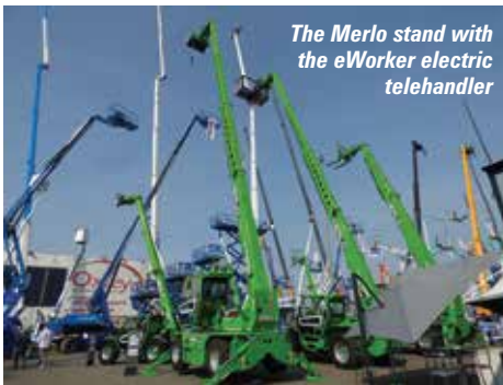
The Merlo stand with the eWorker electric telehandler