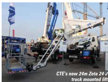
CTE's new 24m Zeta 24 J truck mounted lift