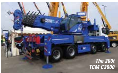
The 200t TCM C2000