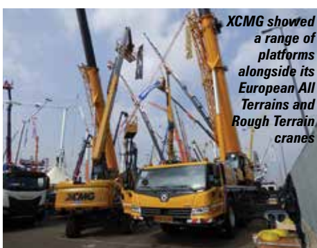
XCMG showed a range of platforms alongside its European All Terrains and Rough Terrain cranes