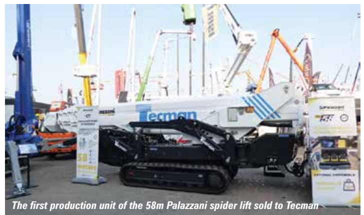
The first production unit of the 58m Palazzani spider lift sold to Tecman