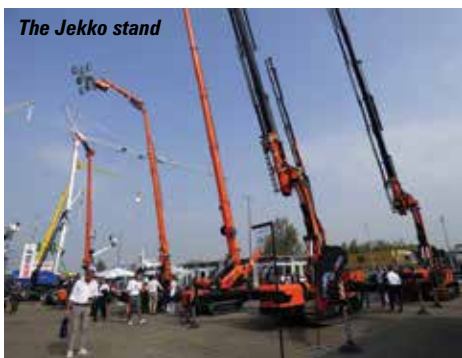
The Jekko stand