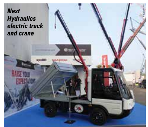
Next Hydraulics electric truck and crane