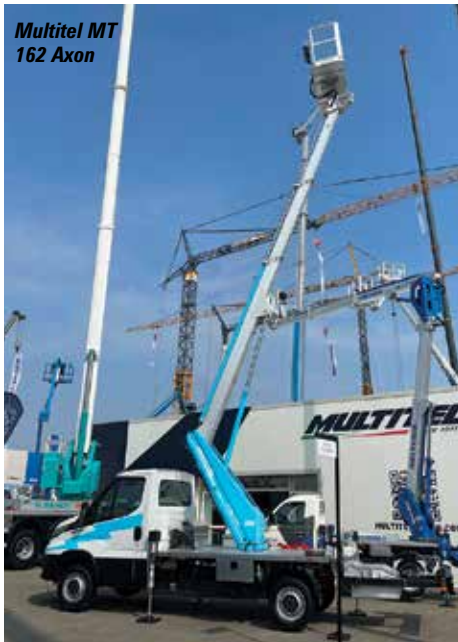
Multitel MT 162 Axon