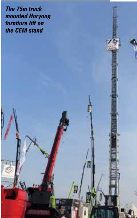
The 75m truck mounted Horyong furniture lift on the CEM stand