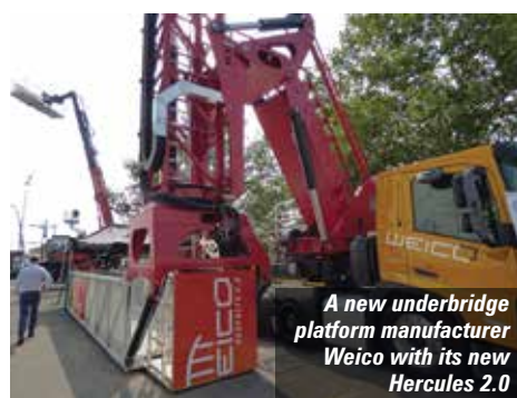
A new underbridge platform manufacturer Weico with its new Hercules 2.0