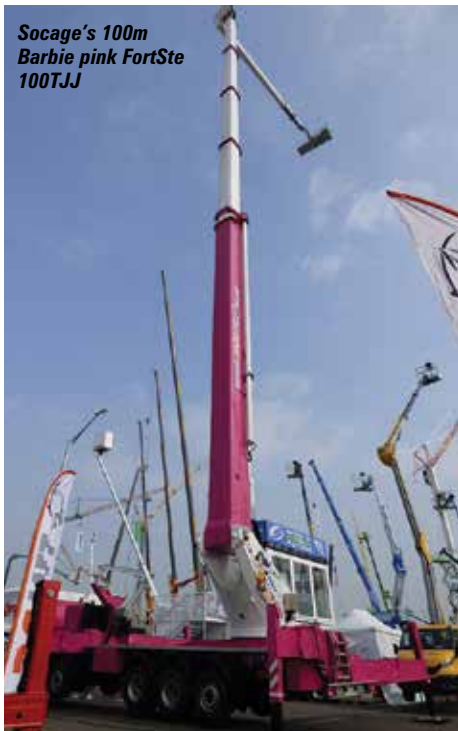
Socage's 100m Barbie pink FortSte 100TJJ