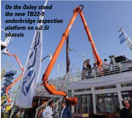
On the Oxley stand the new TB22-9 underbridge inspection platform on a 3.5t chassis