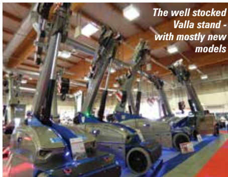
The well stocked Valla stand - with mostly new models