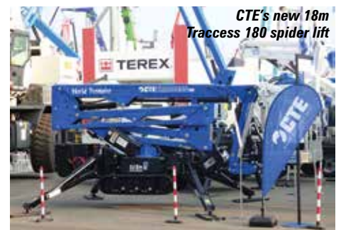
CTE's new 18m Traccess 180 spider lift