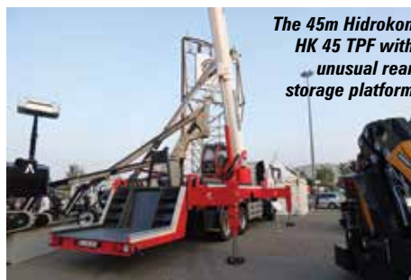
The 45m Hidrokon HK 45 TPF with unusual rear storage platform