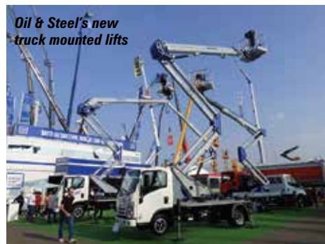
Oil & Steel's new truck mounted lifts