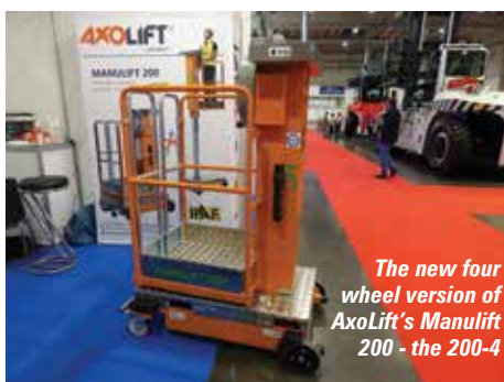
The new four wheel version of AxoLift's Manulift 200 - the 200-4