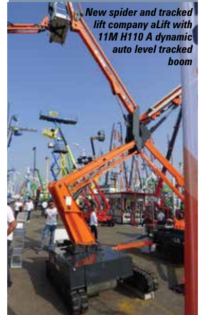
New spider and tracked lift company aLift with 11M H110 A dynamic auto level tracked boom