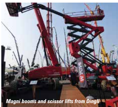
Magni booms and scissor lifts from Dingli