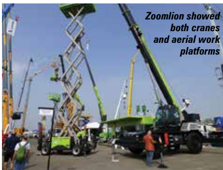
Zoomlion showed both cranes and aerial work platforms