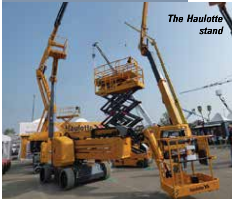
The Haulotte stand