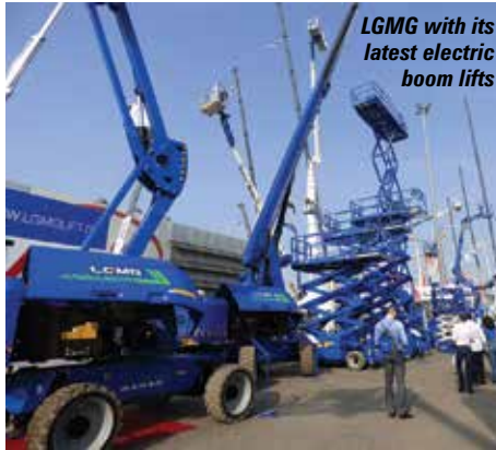
LGMG with its latest electric boom lifts