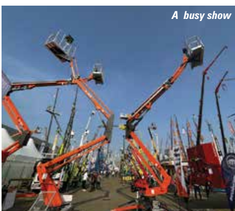
A busy show