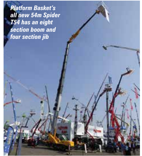
Platform Basket's all new 54m Spider T54 has an eight section boom and four section jib