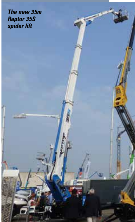
The new 35m Raptor 35S spider lift