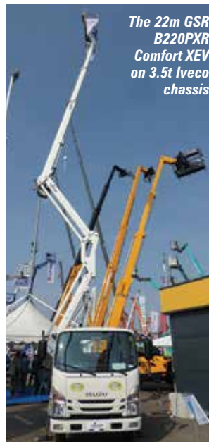
The 22m GSR B220PKR Comfort XEV on 3.5t Iveco chassis

The following photographic roundup mostly covers new or unusual exhibits. We simply do not have space for all exhibits, however a more comprehensive photographic overview can be found on Vertikal.net - https://vertikal.net/en/news/story/42519/gis-in-pictures . We will also be covering the new product launches in more depth in future issues of the magazine.