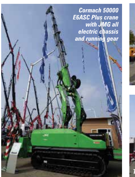
Cormach 50000 E6ASC Plus crane with JMG all electric chassis and running gear