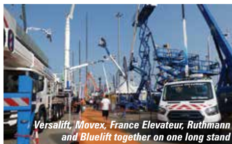
Versalift, Movex, France Elevateur, Ruthmann and Bluelift together on one long stand