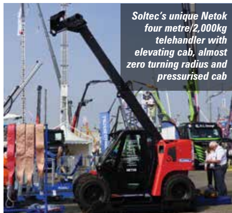
Soltec's unique Netok four metre/2,000kg telehandler with elevating cab, almost zero turning radius and pressurised cab