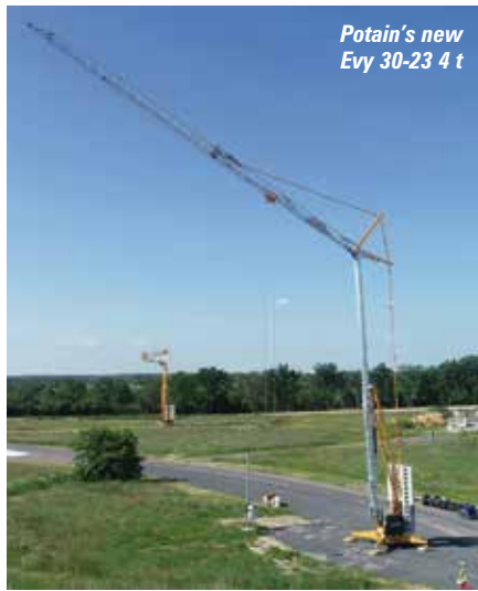
Potain's new Evy 30-23 4 t

The Evy 30-23 4 t is equipped with Potain's Crane Control System (CCS), Smart Set-up, Power Control and Drive Control and comes with the Potain Connect telematic modem, allowing users to monitor and analyse crane utilisation while providing remote and local diagnostics thanks to the Access and Assist applications. When it comes to transportation, the Evy is compatible with existing Potain axles and can be towed as a trailer at 25kph or 80kph when set up as a semi-trailer.