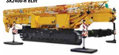
Spierings SK2400-R eLift