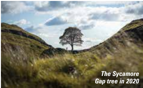
The Sycamore Gap tree in 2020

When it came to be removed a 10 tonne Sunward MCC 1004 telescopic crawler crane was called in from UK distributor GGR. The question now is what to do with the wood.