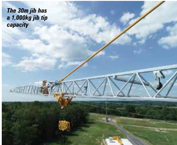
The 30m jib has a 1,000kg jib tip capacity