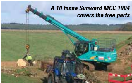
A 10 tonne Sunward MCC 1004 covers the tree parts