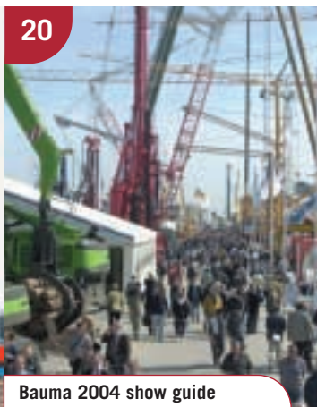
Bauma 2004 show guide