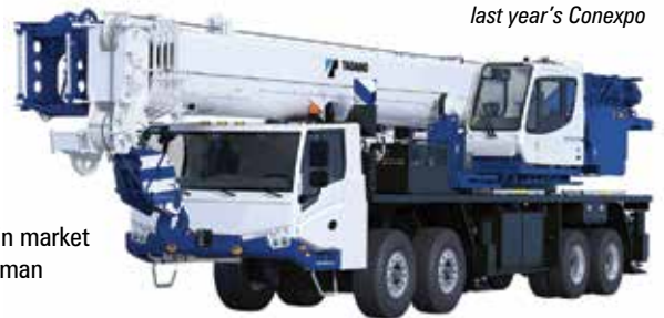
Tadano launched its GT-1200XL-2 and GT-800XL-2 at last year's Conexpo

The GT-800XL-2 features a five section, 47 metre full power boom and can be equipped with the same 17.9 metre extension. Multiple self-removable counterweight configurations are possible up to a maximum of 8.1 tonnes.