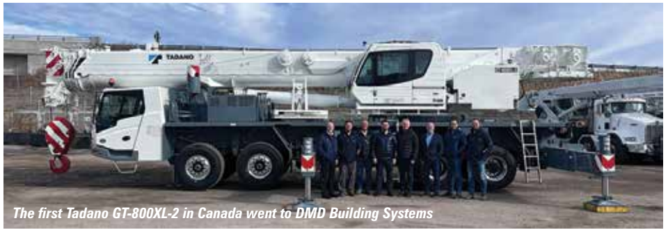
The first Tadano GT-800XL-2 in Canada went to DMD Building Systems