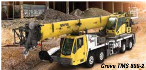
Grove TMS 800-2