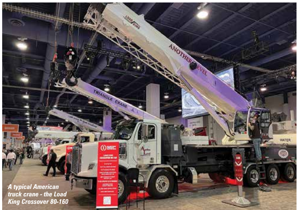
A typical American truck crane - the Load King Crossover 80-160

In North America a different type of truck mounted crane emerged in the form of the Boom Truck, originally conceived by Ray Pittman with his R.O Stinger. Companies such as Manitex and National Crane took the concept upwards from a glorified telescopic loader crane, into long boomed machines that became the standard product for the US street sign business both as a lift crane and with platform attachment. The smaller units could be mounted on the heavy American truck chassis, while the larger units needed sub frames.