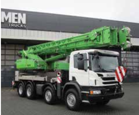
German crane manufacturer Sennebogen stopped production of its 40 tonne HPC 40 in 2020