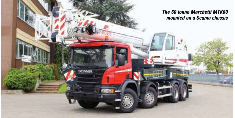
The 60 tonne Marchetti MTK60 mounted on a Scania chassis