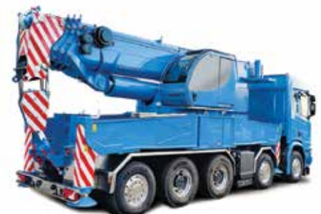
The 300 tonne Idrogru KT300.26S