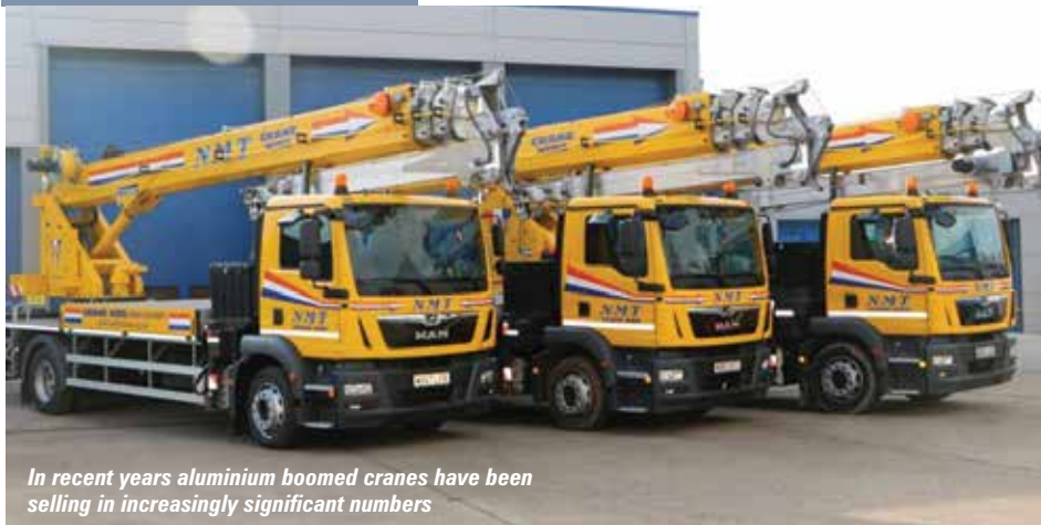
In recent years aluminium boomed cranes have been selling in increasingly significant numbers