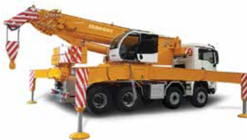
Idrogru has a wide range of three, four and five axle truck mounted cranes up to 300 tonnes

All the truck cranes have a variety of extensions and counterweight configurations, and all offer high capacities with their short booms. The maximum counterweight of the KT300 is 36 tonnes, allowing 19 tonnes to be lifted at a radius of just over 18 metres. ■