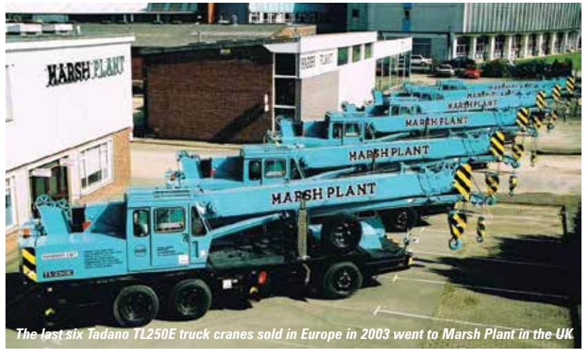
The last six Tadano TL250E truck cranes sold in Europe in 2003 went to Marsh Plant in the UK

These may well be referred to as truck cranes, while the units mounted on full commercial chassis are truck mounted cranes. Companies still making truck cranes include Grove, Tadano and Link Belt and ACE (Action Construction Equipment) in India, plus of course all of the Chinese manufacturers. The new Tadano GT-1200XL and the GT-800XL truck cranes launched at Conexpo last year for the North American market are the latest examples of such cranes, which these days tend to be limited to capacities between 60 and 150 tonnes.