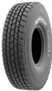
A tyre for an All Terrain crane may cost more than four times that of commercial truck tyre

But why are sales so poor compared to All Terrains - particularly when truck mounts on commercial chassis offer lower running and maintenance costs, particularly tyres and brakes? For example, an online search for the price of a 445/95r25 (16.00R25) Michelin X-Crane+ All Terrain crane tyre came in at £2,200, whereas a 315/80R22.5 Bridgestone M729 TL tyres for a Scania commercial was about £500 fitted and the wider 385/65R22, £600 fitted. Multiply those prices by six or eight for the AT and you are looking at the best part of £15,000 to £17,000 compared to £4,000 to £5,000 for the commercial vehicle.