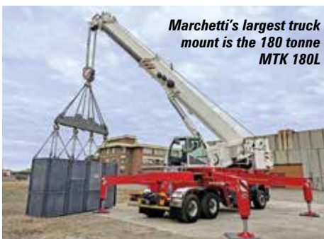
Marchetti's largest truck mount is the 180 tonne MTK 180L

Outside of Italy, Marchetti's largest truck mount, the 180 tonne MTK 180L is a rare sight. The crane features a six section rounded profile main boom made from Weldox (Strenx) steel with a tip height of 40 metres. Total height with the lattice extension is 53 metres.