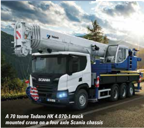
A 70 tonne Tadano HK 4.070-1 truck mounted crane on a four axle Scania chassis