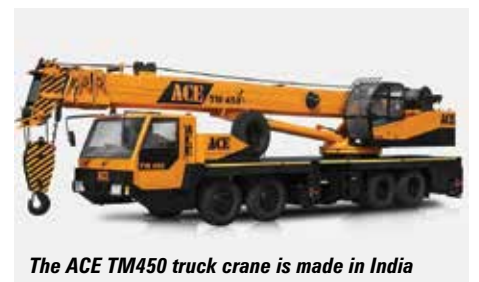
The ACE TM450 truck crane is made in India

Another company producing truck cranes is Action Construction Equipment - ACE - based in India but exporting to numerous countries in the region. The company's TM range runs to