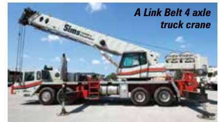
A Link Belt 4 axle truck crane

The superstructure is operated through the truck's PTO and can be mounted on most truck makes, including Iveco, Volvo, Scania, MAN, Mercedes and Astra. Four hydraulically operated swing out outriggers can be operated from both the cab or either side of the chassis. The crane is supplied with an 80 tonne hook block and the three piece counterweight is 15.9 tonnes.