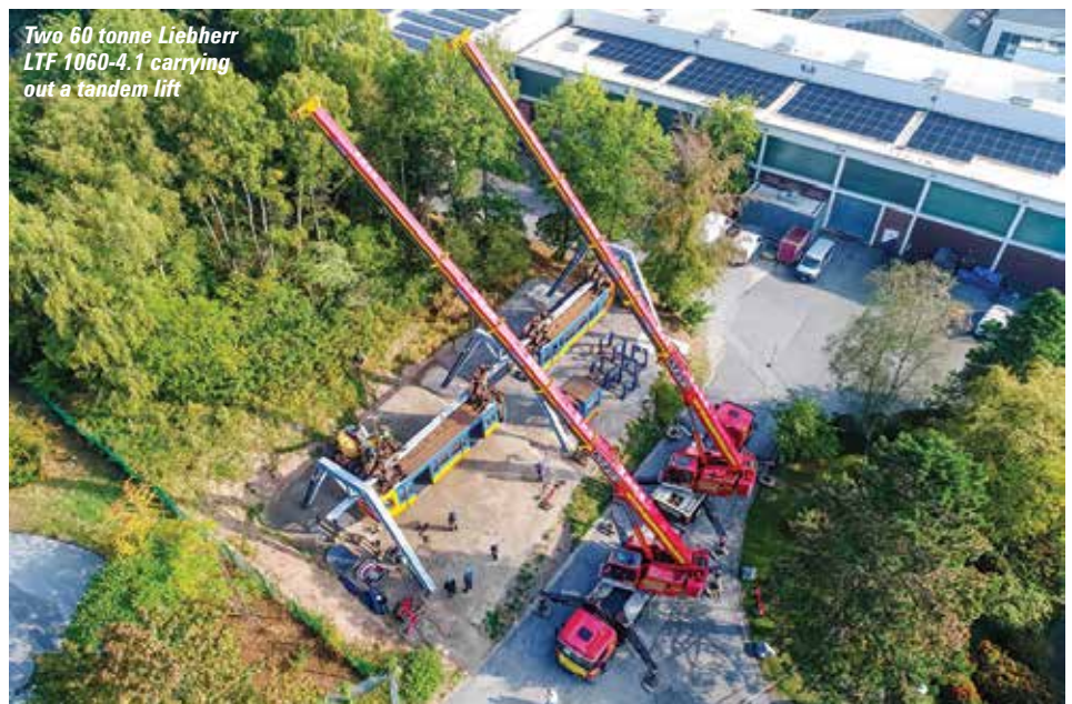
Two 60 tonne Liebherr LTF 1060-4.1 carrying out a tandem lift