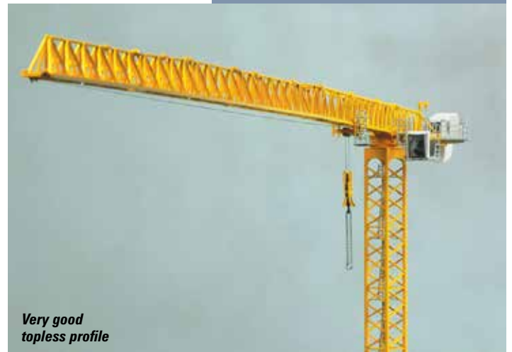
Very good topless profile