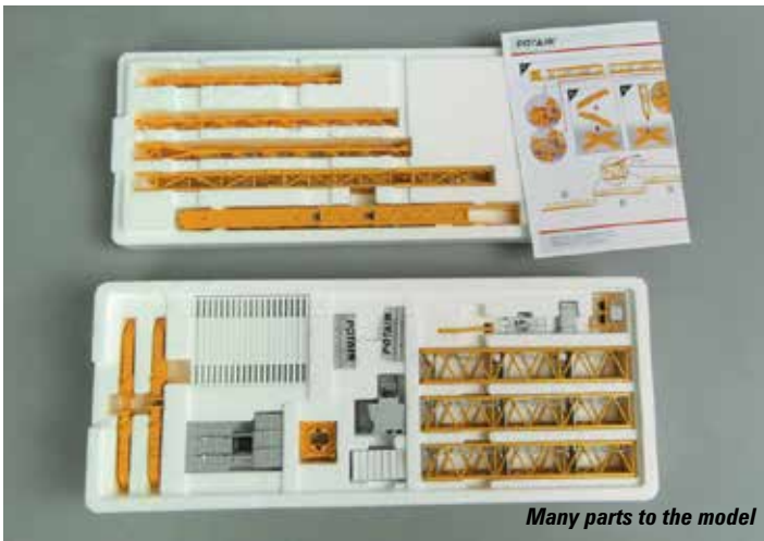
Many parts to the model