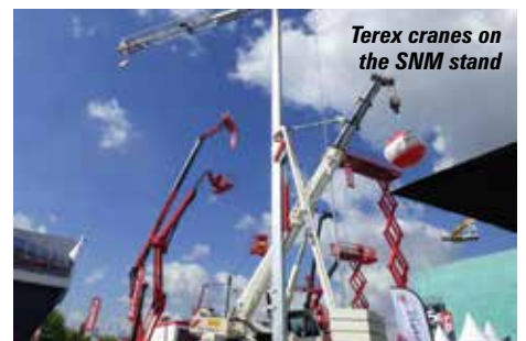
Terex cranes on the SNM stand