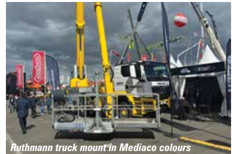
Ruthmann truck mount in Mediaco colours