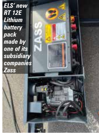
ELS' new RT 12E Lithium battery pack made by one of its subsidiary companies Zass