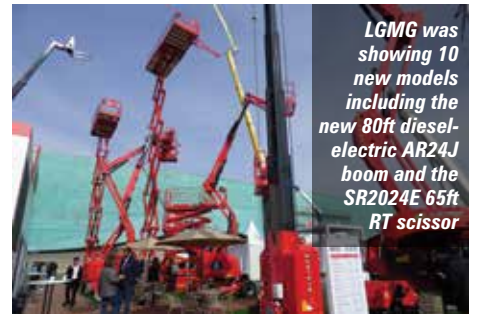
LGMG was showing 10 new models including the new 80ft diesel-electric AR24J boom and the SR2024E 65ft RT scissor