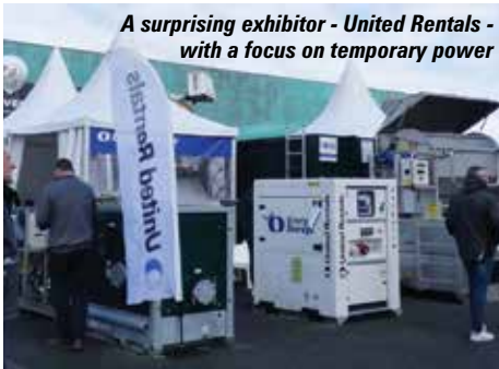
A surprising exhibitor - United Rentals - with a focus on temporary power