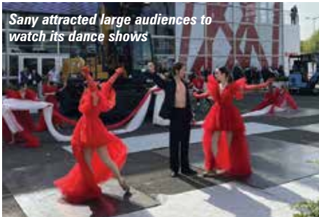
Sany attracted large audiences to watch its dance shows