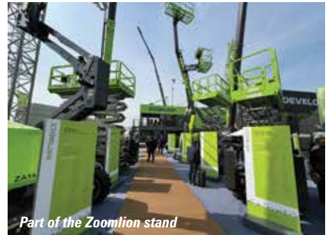
Part of the Zoomlion stand