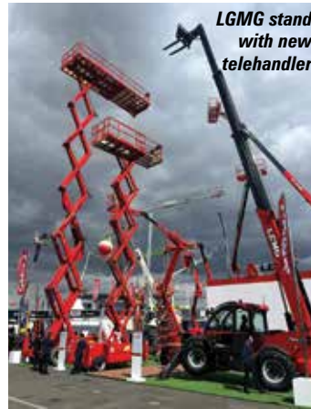
LGMG stand with new telehandler