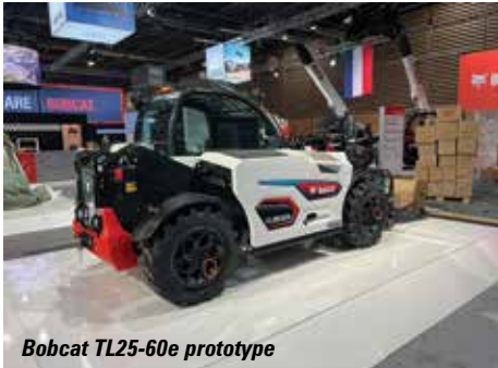
Bobcat TL25-60e prototype