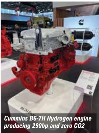
Cummins B6-7H Hydrogen engine producing 290hp and zero CO2