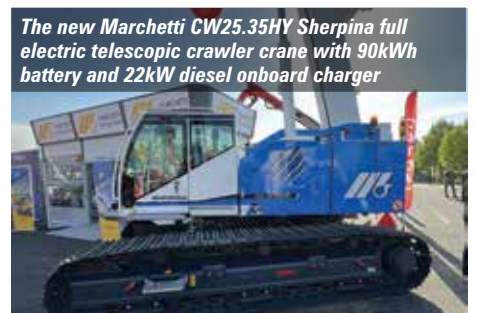
The new Marchetti CW25.35HY Sherpina full electric telescopic crawler crane with 90kWh battery and 22kW diesel onboard charger