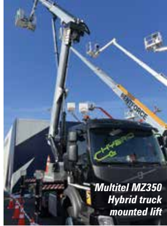
Multitel MZ350 Hybrid truck mounted lift