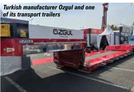
Turkish manufacturer Ozgul and one of its transport trailers