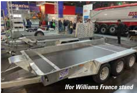
for Williams France stand