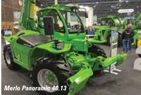
Merlo Panoramic 40.13