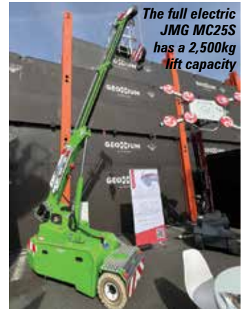
The full electric JMG MC25S has a 2,500kg lift capacity