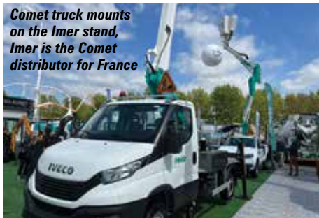
Comet truck mounts on the Imer stand, Imer is the Comet distributor for France