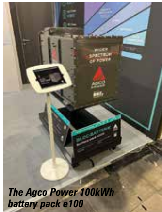
The Agco Power 100kWh battery pack e100