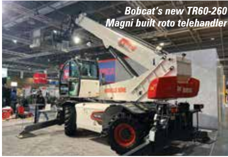
Bobcat's new TR60-260 Magni built roto telehandler