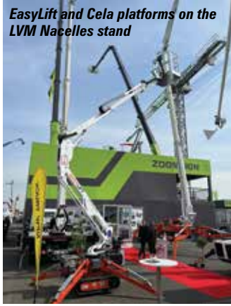
EasyLift and Cela platforms on the LVM Nacelles stand