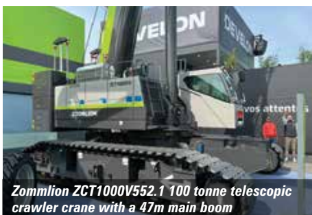
Zommlion ZCT1000V552.1 100 tonne telescopic crawler crane with a 47m main boom