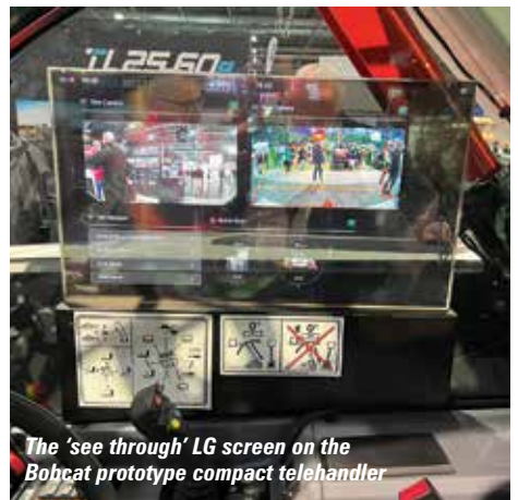
The 'see through' LG screen on the Bobcat prototype compact telehandler