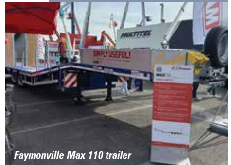
Faymonville Max 110 trailer