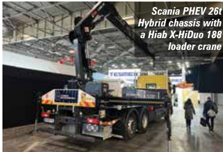
Scania PHEV 26t Hybrid chassis with a Hiab X-HiDuo 188 loader crane