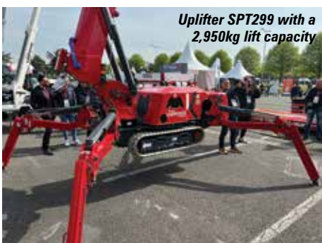
Uplifter SPT299 with a 2,950kg lift capacity