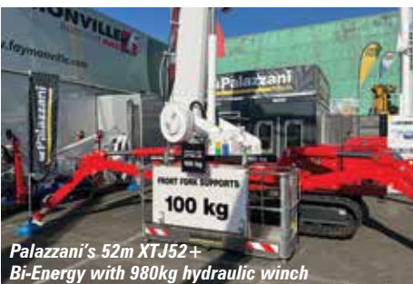
Palazzani's 52m XTJ52+ Bi-Energy with 980kg hydraulic winch