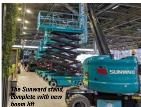
The Sunward stand, complete with new boom lift