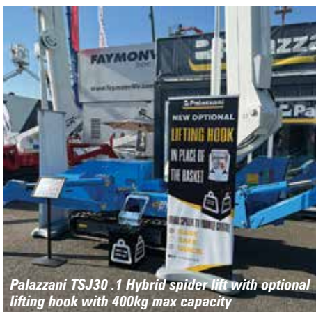
Palazzani TSJ30 .1 Hybrid spider lift with optional lifting hook with 400kg max capacity