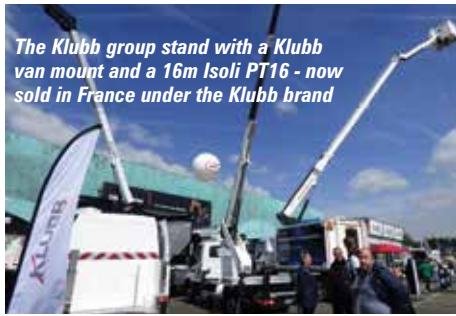
The Klubb group stand with a Klubb van mount and a 16m Isoli PT16 - now sold in France under the Klubb brand