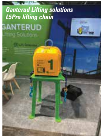
Ganterud Lifting solutions L5Pro lifting chain