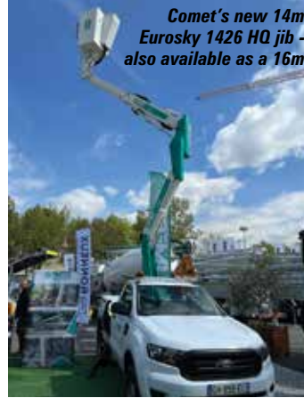
Comet's new 14m Eurosky 1426 HO jib - also available as a 16m