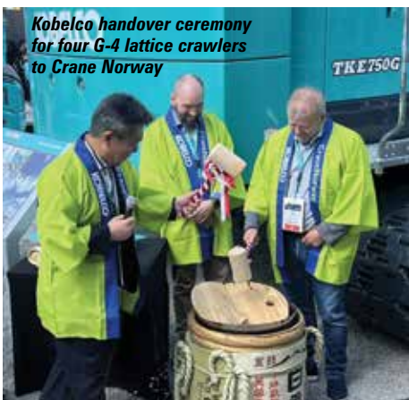
Kobelco handover ceremony for four G-4 lattice crawlers to Crane Norway