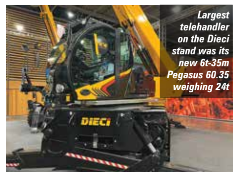
Largest telehandler on the Dieci stand was its new 6t-35m Pegasus 60.35 weighing 24t