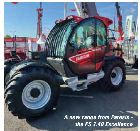
A new range from Faresin - the FS 7.40 Excellence