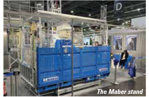
The Maber stand