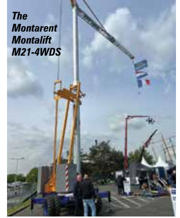
The Montarent Montalift M21-4WDS