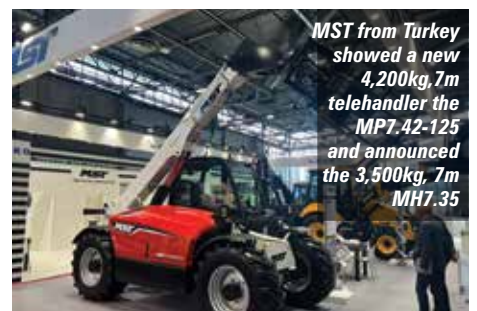
MST from Turkey showed a new 4,200kg, 7m telehandler the MP7.42-125 and announced the 3,500kg, 7m MH7.35