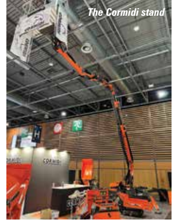
The Cormidi stand