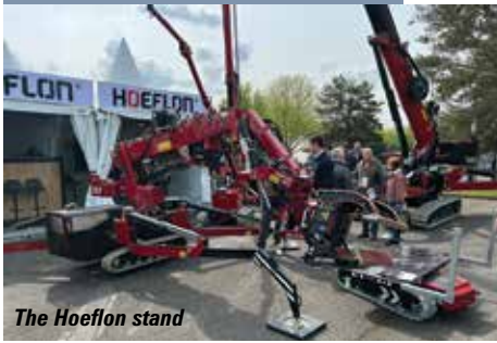
The Hoefflon stand