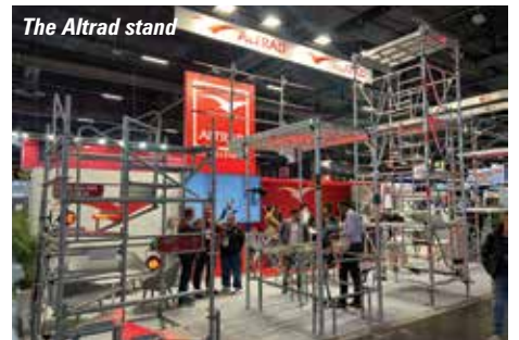
The Altrad stand