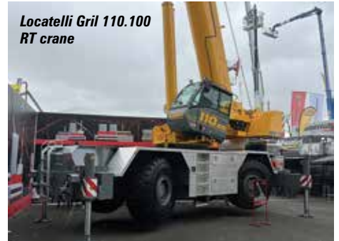
Locatelli Gril 110.100 RT crane