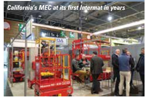
California's MEC at its first Intermat in years