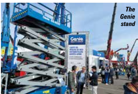
The Genie stand