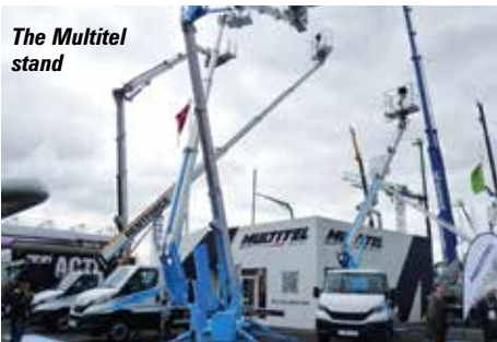
The Multitel stand