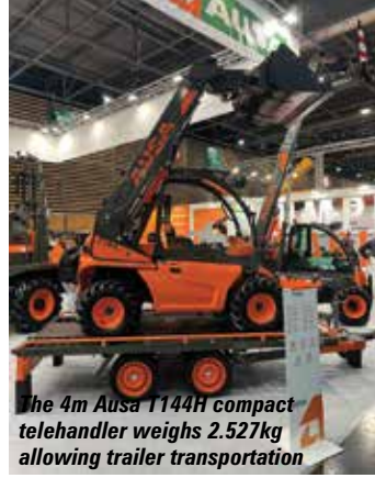
The 4m Ausa T144H compact telehandler weighs 2.527kg allowing trailer transportation