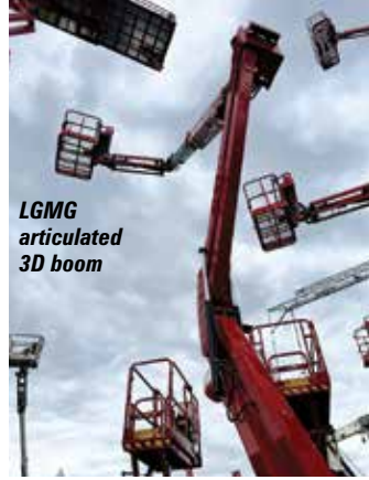
LGMG articulated 3D boom