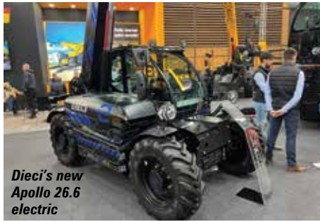
Dieci's new Apollo 26.6 electric