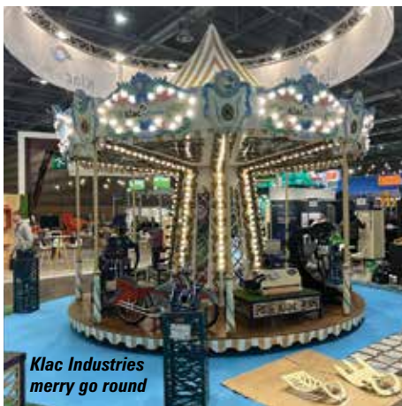
Klac Industries merry go round