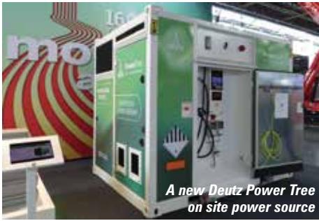
A new Deutz Power Tree on site power source