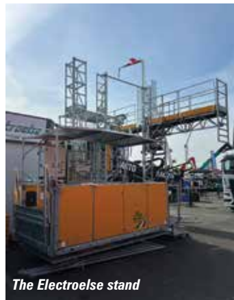
The Electroelse stand