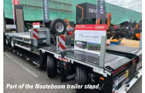
Part of the Nootboom trailer stand