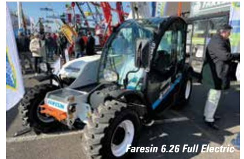
Faresin 6.26 Full Electric