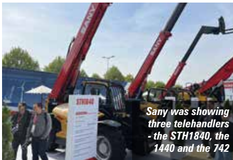
Sany was showing three telehandlers - the STH1840, the 1440 and the 742