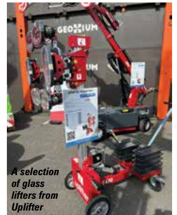
A selection of glass lifters from Uplifter