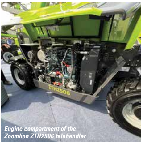
Engine compartment of the Zoomlion ZTH2506 telehandler