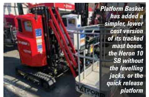
Platform Basket has added a simpler, lower cost version of its tracked mast boom, the Heron 10 SB without the levelling jacks, or the quick release platform