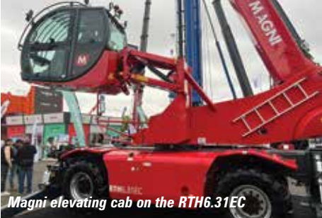
Magni elevating cab on the RTH6.31EC