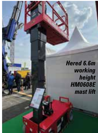
Hered 6.6m working height HM0608E mast lift