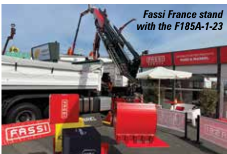
Fassi France stand with the F185A-1-23