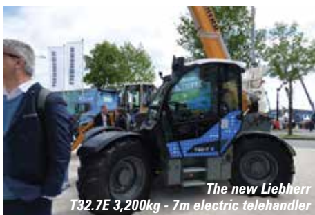
The new Liebherr T32.7E 3,200kg - 7m electric telehandler