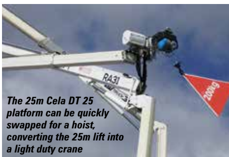
The 25m Cela DT 25 platform can be quickly swapped for a hoist, converting the 25m lift into a light duty crane