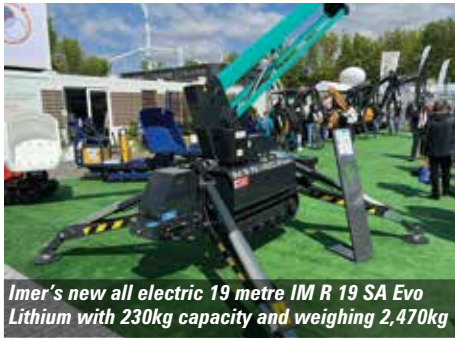
Imer's new all electric 19 metre IM R 19 SA Evo Lithium with 230kg capacity and weighing 2,470kg