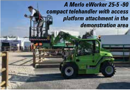
A Merlo eWorker 25-5-90 compact telehandler with access platform attachment in the demonstration area