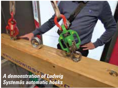
A demonstration of Ludwig System's automatic hooks