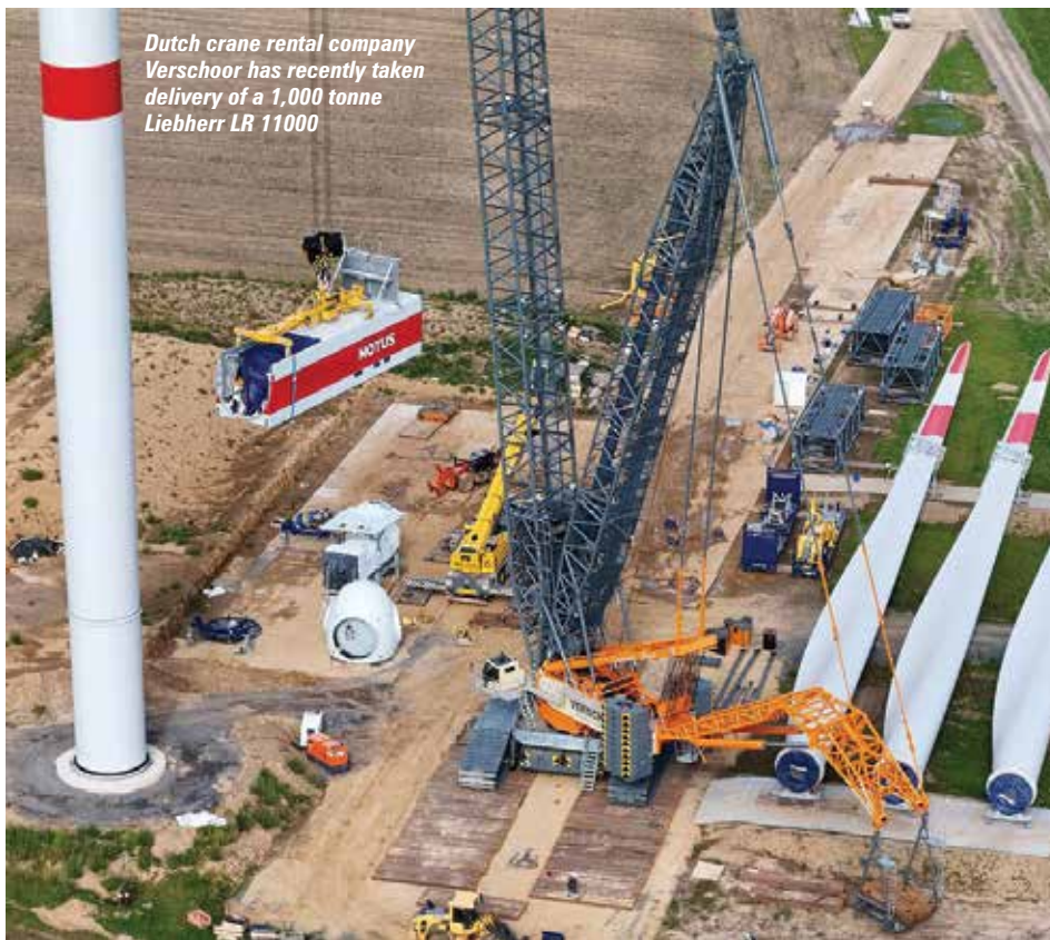
Dutch crane rental company Verschoor has recently taken delivery of a 1,000 tonne Liebherr LR 11000