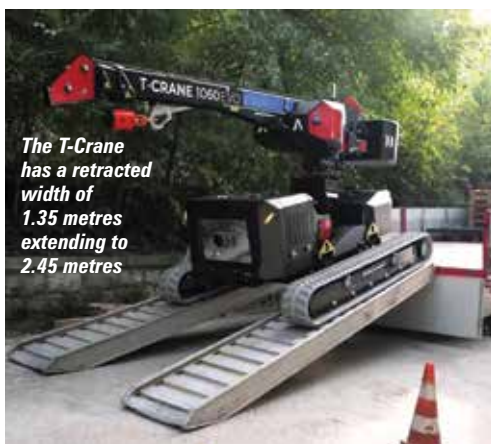
The T-Crane has a retracted width of 1.35 metres extending to 2.45 metres

At the opposite end of the capacity spectrum there are an increasing number of small, tracked cranes. Italian manufacturer Almac is finding a substantial niche for its dynamic self-levelling platforms and has now employed the technology on what it calls its T-Crane.