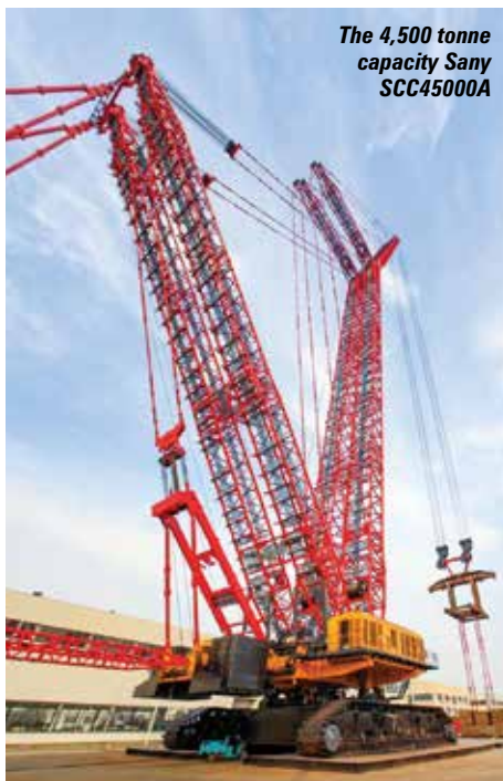
The 4,500 tonne capacity Sany SCC45000A

Marchetti has also launched its first North American crane - a standard version of the CW25.35. The first unit was purchased by Powell