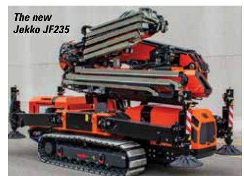
The new Jekko JF235

Power comes from a Stage V diesel with intelligent electronic system that adapts engine speed to the demands of the hydraulic system, helping reduce fuel consumption. An AC plug-in motor provides quiet clean operation where needed. Accessories include a 1.5 tonne winch, mechanical extensions, lattice jibs, a range of man baskets and manipulators. ■