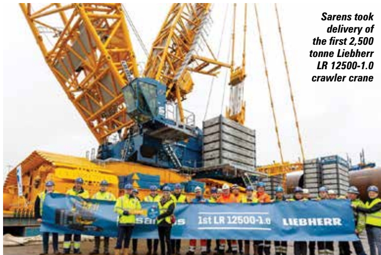
Sarens took delivery of the first 2,500 tonne Liebherr LR 12500-1.0 crawler crane

to 59 metres and with up to 40 degrees of offset. The new crane fits into the product line between the 673 E and the 6103 E.