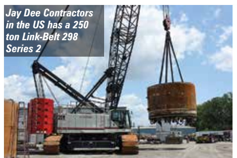
Jay Dee Contractors in the US has a 250 ton Link-Belt 298 Series 2