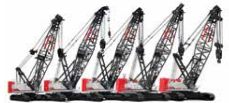
Link-Belt Cranes' new lattice crawler cranes are equipped with Tier III engines for Latin American markets