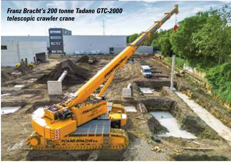
Franz Bracht's 200 tonne Tadano GTC-2000 telescopic crawler crane

real time along with the data fed into the crane's control system to calculate the optimum load chart for the actual set-up, ie 'Variobase' for crawler cranes. The overall width with the tracks fully extended is 5.8 metres, with alternative widths of 3.5 and 5.0 metres.