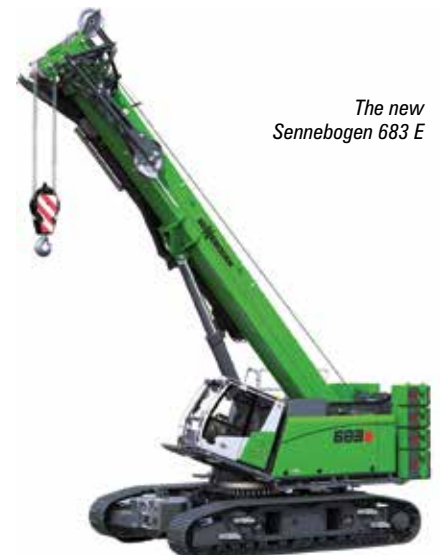
The new Sennebogen 683 E

Early last year Sennebogen launched its own branded version of the 80 tonne crawler crane, which, unusually it initially built for Manitowoc as the Grove GHC85. The Sennebogen 683 E has virtually the same specification, with a five section 42 metre full power main boom topped by an eight to 15 metre solid construction bi-fold swingaway which takes the maximum tip height