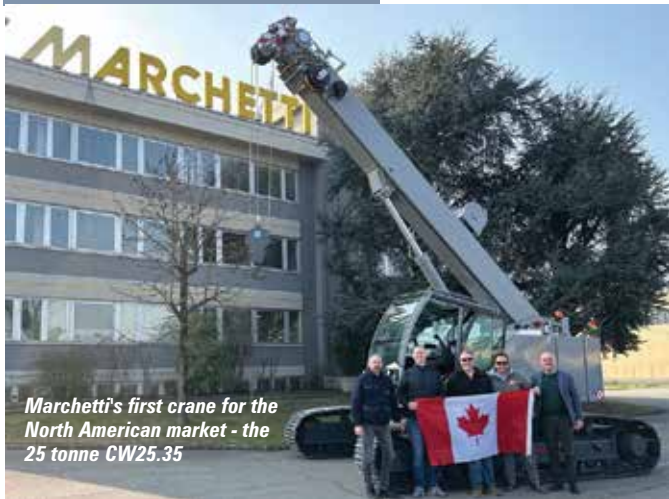
Marchetti's first crane for the North American market - the 25 tonne CW25.35