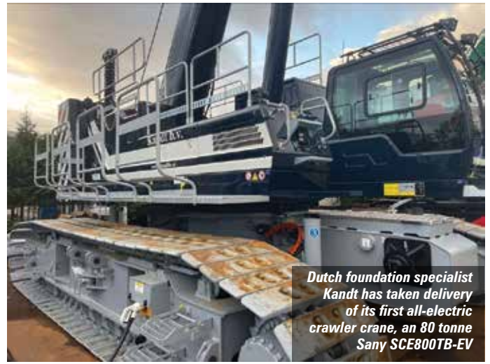
Dutch foundation specialist Kantt has taken delivery of its first all-electric crawler crane, an 80 tonne Sany SCE800TB-EV

Last summer Finnish crane and access rental company J. Helaakoski took delivery of the first 135 tonne Sany SCE 1350 A lattice crawler crane to arrive in Finland. The SCE 1350 is rated at four metres and features a maximum boom of 76 metres at which it has a capacity of 22.6 tonnes at a 12 metre radius. A fixed jib can be set with an offset of 10 to 30 degrees with a maximum system length 92 metres - 61 metres of main