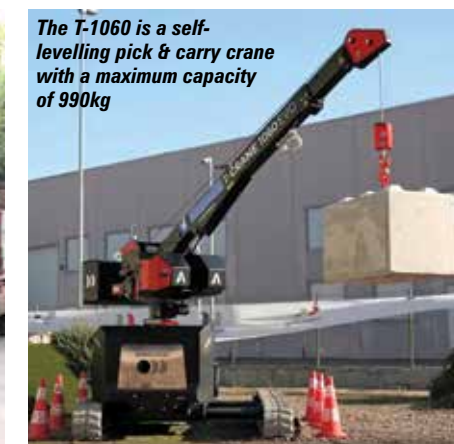
The T-1060 is a self-levelling pick & carry crane with a maximum capacity of 990kg

The first model, the T-1060, is a self-levelling pick & carry crane with a maximum capacity of 990kg at a 3.5 metre radius, and a maximum tip height of 7.7 metres at which it can still handle 990kg. The maximum radius is 6.1 metres with a capacity of 450kg. The winch comes with 30 metres of wire rope and charts are provided for all slopes, track widths and slew angles - with or without counterweight.