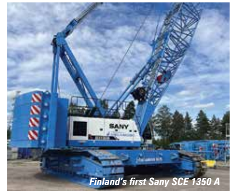
Finland's first Sany SCE 1350 A

boom plus the maximum 31 metre jib - with a capacity of six tonnes at 24 metres radius.