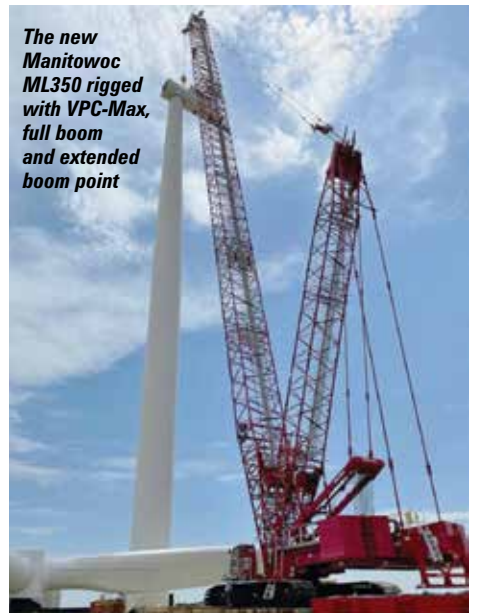
The new Manitowoc ML350 rigged with VPC-Max, full boom and extended boom point