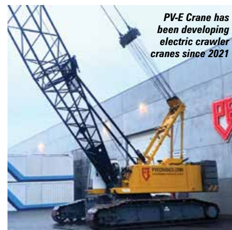
PVE Crane has been developing electric crawler cranes since 2021

Dutch company PVE Cranes - known for sales and rental of mobile and crawler cranes - developed the 70 tonne DCT70 diesel powered telescopic crawler crane mid last year. The venture was with its sister company PV-E Crane, which has been developing electric crawler cranes since 2021. Power for the DCT70 is supplied by a Stage V Cummins diesel engine with 168kW at 2200 rpm. The five section 38 metre boom has optional six and eight metre jibs giving a total boom length of 52 metres. Standard equipment includes the self-erecting counterweight system, two winches, and a camera system to monitor the load. Additional LED working lights, custom paint, and a tilting or pressurised cabin can also be specified.