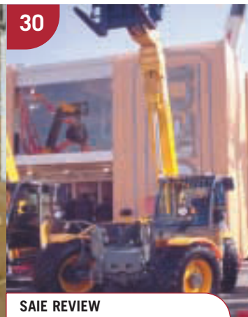
30 SAIE REVIEW