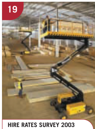
19 HIRE RATES SURVEY 2003

While every effort is made to ensure the accuracy of information published in Cranes & Access , the Editor and Publisher can accept no responsibility for inaccuracies or omissions. Views expressed in articles are those of the authors and do not necessarily reflect those of the Editor or Publisher. Material published in Cranes & Access is protected under international copyright law and may not be reproduced without prior permission from the publishers.