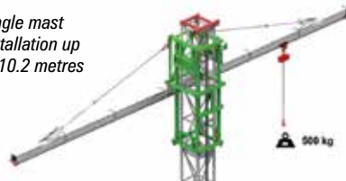
Single mast installation up to 10.2 metres

Once attached, the platform is raised - complete with the monorail - to the required height. The frames supporting the beam are then pinned into place on the mast, with the platform then able to move freely below. A classic application is cladding installation with the hoist lifting the panels into position controlled by those on the platform. The maximum beam length for a single mast platform is 10.2 metres while 29.36 metres is possible with a twin mast installation.