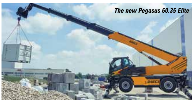
The new Pegasus 60.35 Elite