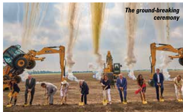
The ground-breaking ceremony

JCB sold its first machine in North America in 1964 and opened its first factory in 2001 in Savannah, Georgia, which now employs 1,000. The company, which celebrates its 80th anniversary next year employs 19,000 staff across 22 facilities, 11 in the UK, seven in India and others in Brazil and China.