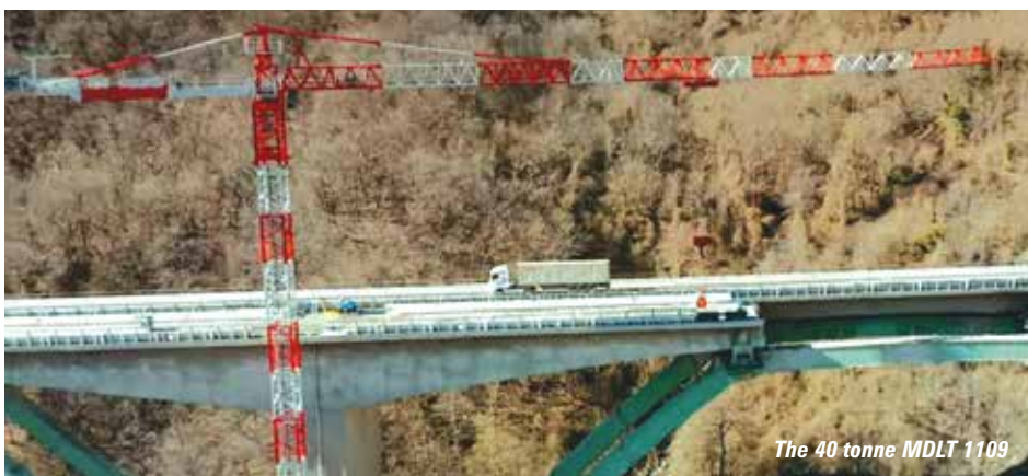
The 40 tonne MDLT 1109

The crane can be mounted on Potain's standard 2.45 metre square K850 tower, rather than the four metre tower base of its predecessor, the MD 1100. Maximum free standing height under the hook is 60.7 metres on the counterweighted base or 87.6 metres on an appropriate foundation. It can handle its 40 tonnes maximum capacity between 22 and 25 metres while the 80 metre jib tip capacity is 11.1 tonnes.