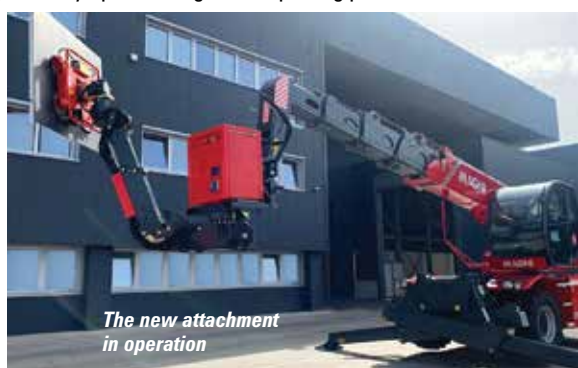
The new attachment in operation

Designed for use with Magni's 360 degree models, the Vacuum 'ER-Litocran 700' comprises a power pack, a short two section telescopic jib with 180 degrees of articulation (90 degrees above and 90 degrees below horizontal) mounted on a slew ring under the power pack, with a slewing range of 180 degrees - 90 degrees either side of centre. The jib is topped by the vacuum suction head which has 360 degrees of rotation and can be manually tilted by up to 90 degrees for placing panels on a wall or ceiling, all of which can be operated via a remote controller.