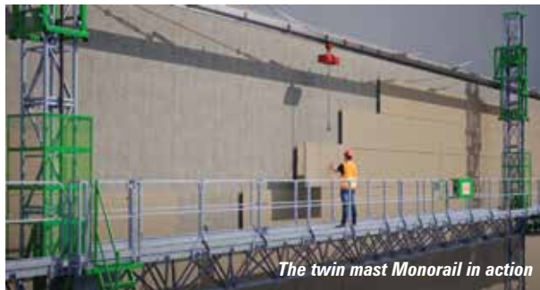
The twin mast Monorail in action