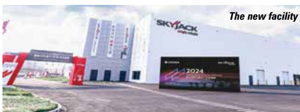
The new facility

It initially used part of an existing Linamar plant, building units for the Chinese market. This new facility is part of the company's strategy to build products closer to the markets where they will be sold and used.