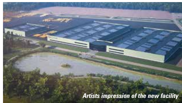
Artists impression of the new facility