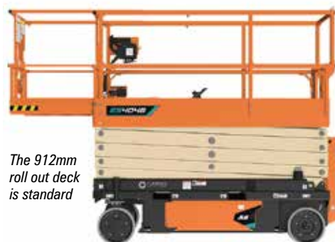
The 912mm roll out deck is standard

JLG has launched the European version of its 40ft ES4046 electric drive slab scissor lift with a 13.9 metre indoor working height and 350kg platform capacity or 10.75 metres and 250kg when working outdoors. The overall width is 1.17 metres, overall length 2.71 metres, and a stowed height of 1.99 metres with guardrails folded. Overall weight is 2,826kg.