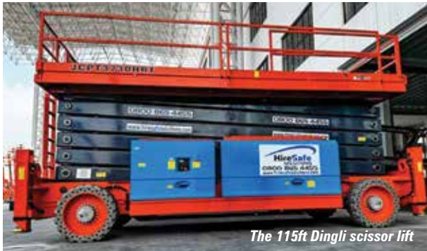
The 115ft Dingli scissor lift

Overall stowed dimensions are eight metres by three metres with an overall height of 4.2 metres and total weight of 39.5 tonnes. Power choices include diesel, all-electric or hybrid.