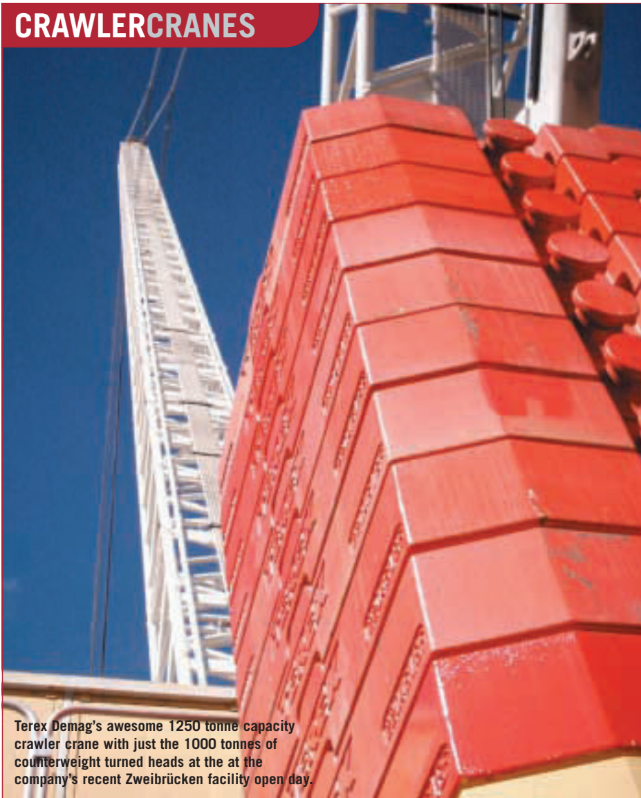
Terex Demag's awesome 1250 tonne capacity crawler crane with just the 1000 tonnes of counterweight turned heads at the at the company's recent Zweibrücken facility open day.