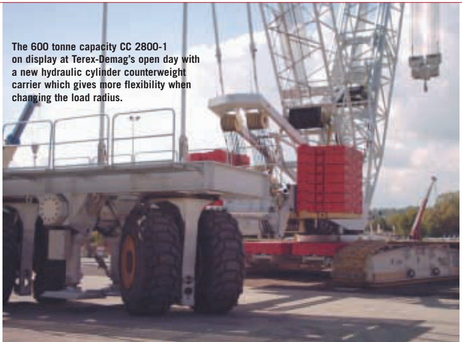
The 600 tonne capacity CC 2800-1 on display at Terex-Demag's open day with a new hydraulic cylinder counterweight carrier which gives more flexibility when changing the load radius.

All UNIC mini crawlers are now available for hire through GGR or for sale through UNIC Crane Sales Europe. ■