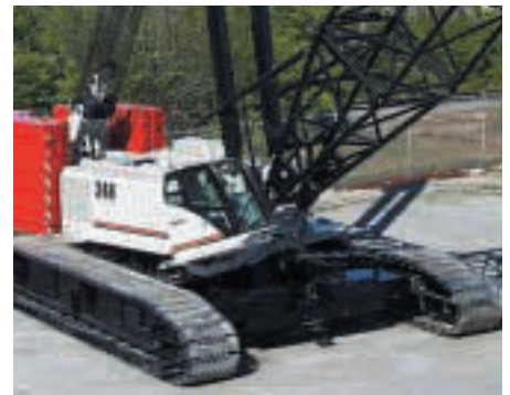
(Above) Link-Belt's new 348 HYLAB 5 features a new wider cab with 20 degree tilt, air conditioning, operator friendly controls, such as backlit gauges, adjustable armrest-mounted single-axis controls, and low-effort hydraulic pedals with minimal pedal range motion.

Liebherr Werk Nenzing has also produced a special undercarriage with retractable tracks for