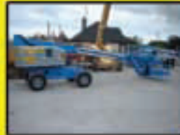
Genie S45 - 4wd telescopic Cummins diesel 51ft work height. Choice Price '99 - £ 18,000 € 25,750