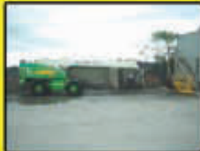
Grove MZ82c - 4wd telescopic Cummins diesel 82ft work height. Choice Price '98 - £ 20,000 € 28,500