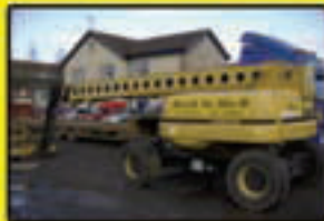
Grove Mz72dxt - 4wd telescopic Deutz diesel 72ft work height. Choice Price '99 - £ 24,000 € 34,250