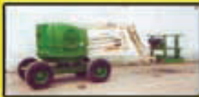
Grove Amz51xt - 4wd articulated Hatz diesel 51ft work height. Choice Price '99 - £ 11,000 € 15,750