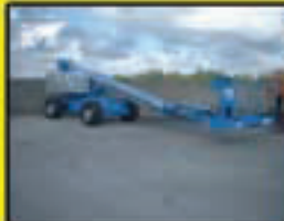
Genie S85 - 4wd telescopic Cummins diesel 91ft work height. Choice Price '99 - £ 35,000 € 50,000