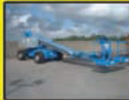
Genie S65 - 4wd telescopic Cummins diesel 71ft work height. Choice. Price '99 - £ 27,000 € 38,500