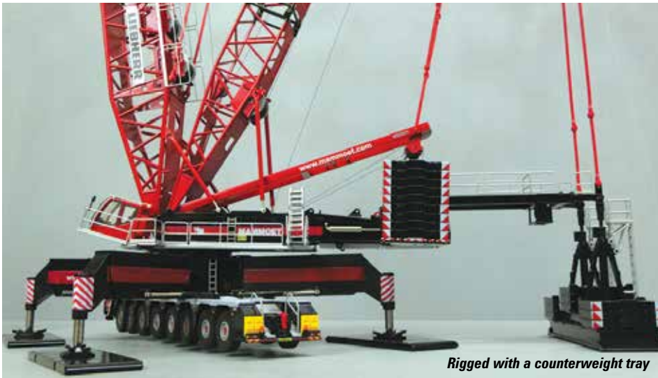
Rigged with a counterweight tray