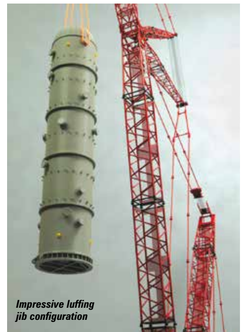
Impressive luffing jib configuration