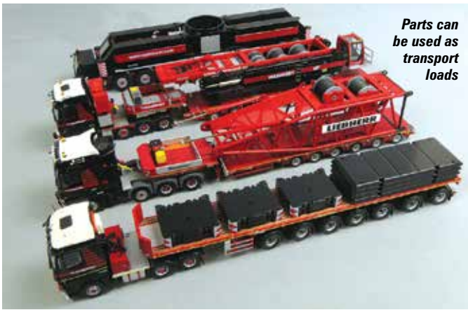
Parts can be used as transport loads