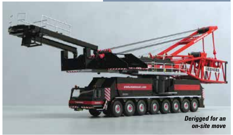
Derigged for an on-site move