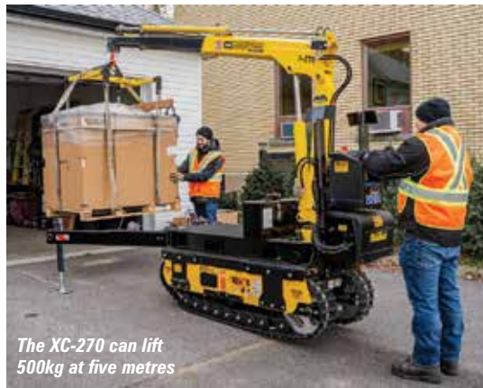
The XC-270 can lift 500kg at five metres

In Quebec, Canada, Movex Innovation produces the XC-270 Cross-country mini crawler crane. Based on its XC-30 All Terrain carrier, the crane is also available as the TT-270, a stair climbing crane based on the company's TT-66 stair climbing chassis.