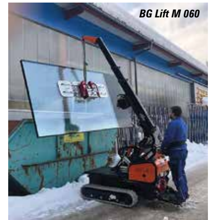
BG Lift M 060