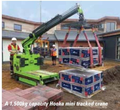
A 1,500kg capacity Hooka mini tracked crane

Largest in the range is the four tonne/metre MCR40 which can lift 2,100kg at a 1.87 metres radius or reach 7.1 metres at which point it has a capacity of 400kg. Maximum tip height on the five section boom is 8.3 metres, while a manual section takes this to 9.3 metres. Overall length is 2.54 metres with a total weight of around 1,500kg depending on power source.