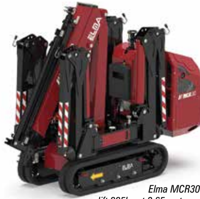
Elma MCR30 can lift 995kg at 2.65 metre radius

The MCR30 and MCR40 are three and four tonne mini tracked cranes with two stage spider type outriggers taking the working foot print to 3.85