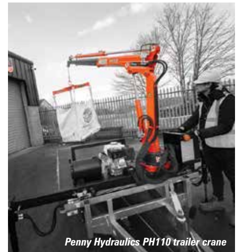
Penny Hydraulics PH110 trailer crane