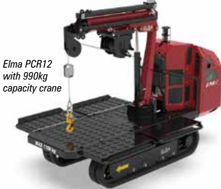
Elma PCR12 with 990kg capacity crane

The entire range has extendible width tracks - from 700 or 790mm wide to 1.18 metres. They are offered with an engine, usually petrol, or a form of hybrid version with the addition of a single phase 220 volt AC electric motor, while a lithium ion battery powered option is also available.