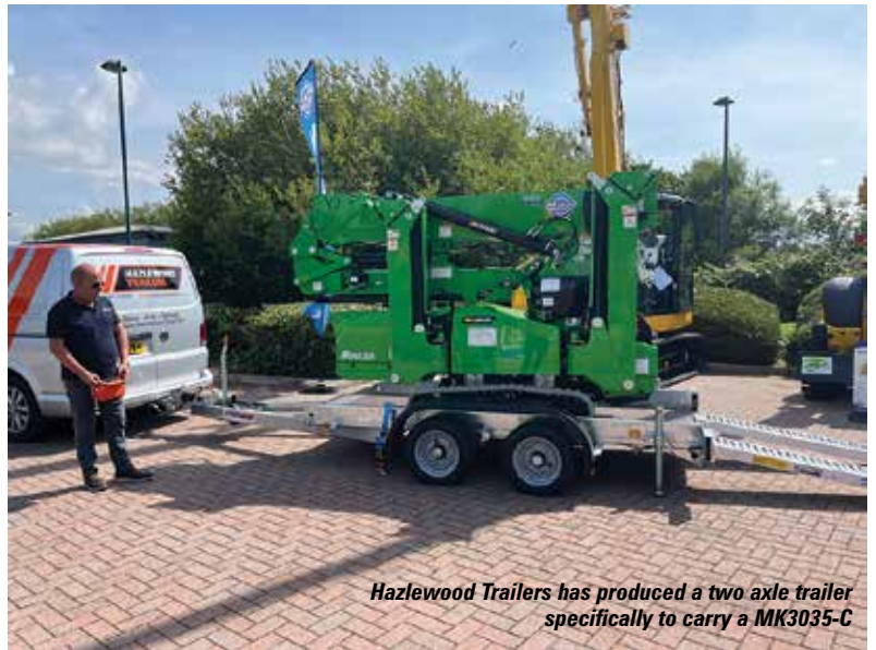
Hazlewood Trailers has produced a two axle trailer specifically to carry a MK3035-C