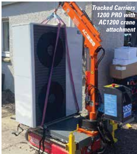
Tracked Carriers 1200 PRO with AC1200 crane attachment

A wide range of accessories for the carriers include a fifth wheel and a dolly for transporting long and heavy loads. The dolly - available on the 1200 and 2200 R/PRO models - is manually steerable and gives an additional 1,000kg capacity. Also available on the same models is the rotating platform making it easier to manoeuvre loads through awkward spaces, an A frame stillage for moving sheets of glass and other panel materials, a dozer blade, corner posts, tow bar, winch, stair climbing kit, pallet cradle, pivot bearers and the AC1200 crane attachment.