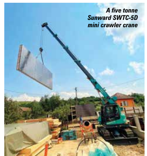
A five tonne Sunward SWTC-5D mini crawler crane

loader crane at one end of the bed is the simple answer and several manufacturers now offer such a machine. That concept appears to be developing into a sector of its own.