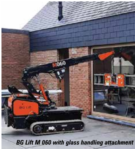
BG Lift M 060 with glass handling attachment