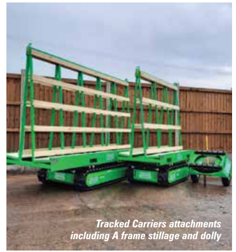
Tracked Carriers attachments including A frame stillage and dolly