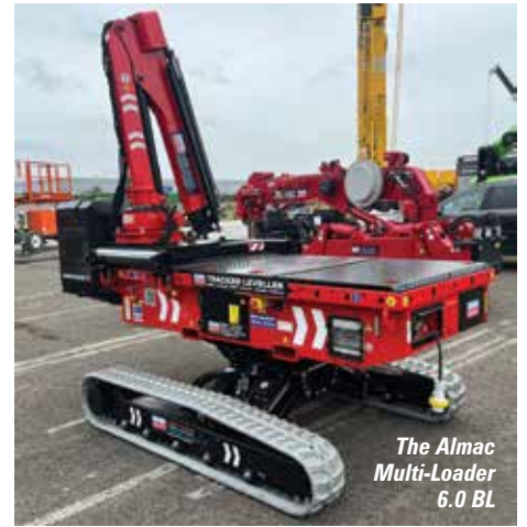
The Almac Multi-Loader 6.0 BL

The Multi-Loader 6.0 BL is a sizeable bit of kit weighing 2,400kg or 2,900kg with the crane