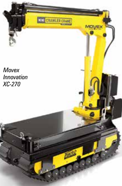
Movex Innovation XC-270

Movex says the crane is ideal for moving pad mounted transformers, as well as plant maintenance duties in the mining sector, transporting and installing components such as pumps, motors, conveyor parts etc in factories, moving generators in confined spaces or moving structural beam, doors and glass for installation. Both models are battery powered and wireless remote controlled.