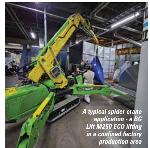
A typical spider crane application - a BG Lift M250 ECO lifting in a confined factory production area

Another emerging product are small loader cranes with capacities up to about six tonnes mounted on the increasingly popular tracked material carriers. The tracked carriers have been growing in popularity for several years now making it easier to move bulky and heavy materials, particularly on uneven ground or fragile surfaces. However, there is always the problem of how to load the material or item that needs to be moved onto the carrier. A small