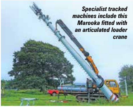
Specialist tracked machines include this Marooka fitted with an articulated loader crane

They are tremendously compact and are light enough to be transported to site on a 3.5 tonne trailer and when working have very low ground bearing pressure.