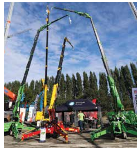
The three MK3053-Cs at Vertikal Days had been bought by AMC, Lift Mini Cranes and Lift Assist

To add to the MK3053-C's appeal, Kranlyft has