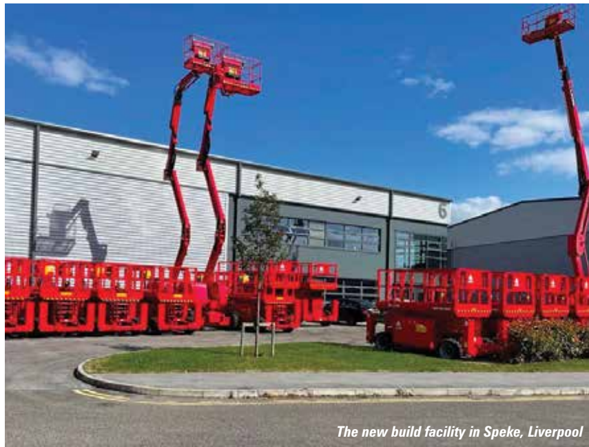
The new build facility in Speke, Liverpool

LGMG and APS signed a distribution agreement for the UK in 2019 and has seen substantial success since then, delivering around 4,500 units to UK and Irish customers.