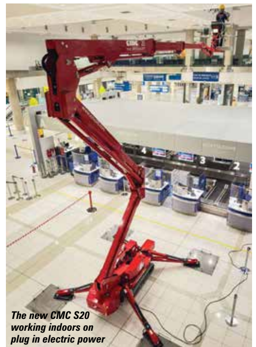
The new CMC S20 working indoors on plug in electric power

Standard features include protective covers for the outrigger cylinders, proportional hydraulic controls and radio remote controller. Power options include diesel with or without AC power or lithium battery pack.