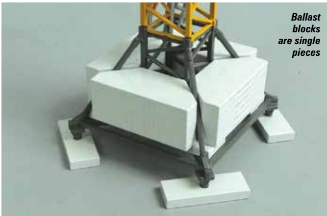
Ballast blocks are single pieces