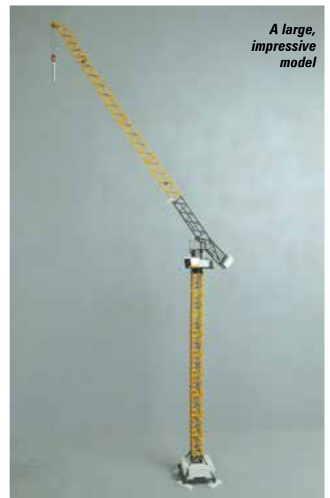
A large, impressive model

Overall, this is a very good looking model only compromised from some angles by the hollow jib bottom. The tower can be built in different heights, but the jib configuration is fixed, and most parts do not make realistic transport loads. It costs €210 excluding VAT from the Liebherr Webshop.