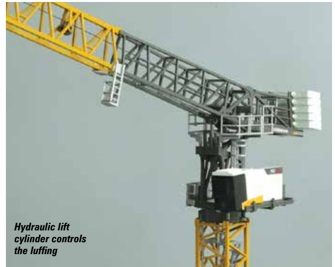
Hydraulic lift cylinder controls the luffing