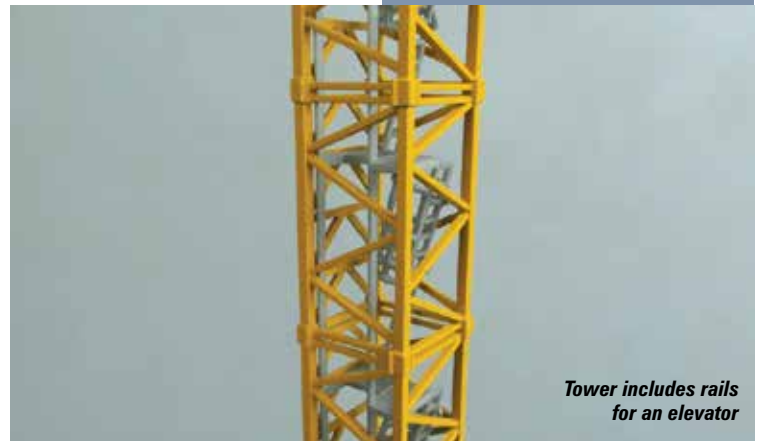
Tower includes rails for an elevator