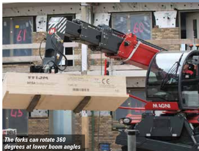
The forks can rotate 360 degrees at lower boom angles

The forks are compatible with all Magni TH fixed frame and RTH 360 degree models. Maximum capacity over the front is 2,300kg on the more compact TH models and up to 5,000kg on the RTH models. The capacity with the forks rotated 90 degrees is 2,500kg on all compatible models.