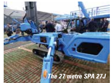
The 27 metre SPA 27J