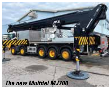
The new Multitel MJ700

The new hybrid power pack includes two 80V/210Ah lithium batteries with a total of around 33KWh of power, driving an 80V/20KW electric motor, coupled to a hydraulic pump. The machine has enough battery power to fully extend and retract the boom at least four times. A full recharge takes four hours when connected to a 400V network or five hours with the on-board diesel generator. The unit can also be operated while plugged in or operate as a normal diesel machine.