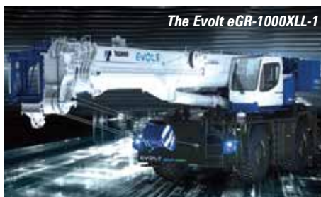
The Evolt eGR-1000XLL-1

Features include a five section 51 metre main boom and 10.7 to 17.1 metre bi-fold swingaway extension with up to 45 degrees of offset. It also has a new 'Smart Counterweight' system providing two counterweight positions which boosts capacities by up to 20 percent when in the extended position. Maximum radius on the main boom is 47.2 metres.