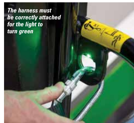
The harness must be correctly attached for the light to turn green

Niftylift's ClipOn harness attachment sensor has now been rolled out across its range of HR self-propelled boom lifts. The ClipOn system activates when the key switch is turned on. If the operator has not attached their lanyard and attempts to move the machine, bright red LEDs above each anchor point illuminate and an alarm sounds. Once the harness is attached the LEDs turn green, and the alarm stops. The system also includes LEDs under the platform floor for those working below. It can also be retrofitted to older Niftylift platforms.