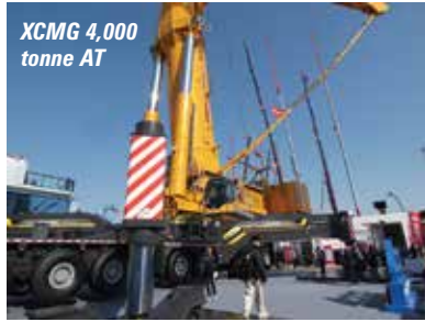
XCMG 4,000 tonne AT