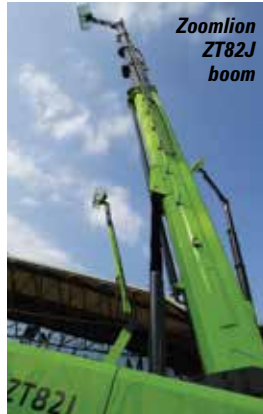
Zoomlion ZT82J boom