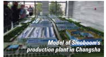
Model of Sinoboom's production plant in Changsha

Upgraded models include: Four articulated booms - the 50ft AB15J, 52ft AAB16EJ, 73ft AB22J Plus and 66ft AB26EJ Plus 25.6 metre work height, 19 metre outreach and rotating jib. Two upgraded slab electric micro scissor lifts, the 14ft 0407EN and 16ft 0607EN, with larger tyres and slightly wider scissor stack