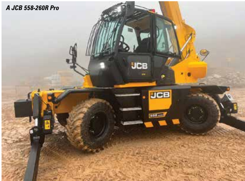
A JCB 558-260R Pro

Also announced is the 'Intellisense' human recognition system which detects pedestrians within a pre-set proximity of the machine, setting off audible and visual warnings both inside the cab and externally to warn those in the immediate vicinity. The system uses four AI cameras to cover the sides and rear of the machine along with a standard forward facing camera. The system will initially be available on the 540-140 and 535-125 telehandlers.