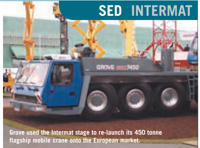
Grove used the Internat stage to re-launch its 450 tonne flagship mobile crane onto the European market.

Nearly 200 participants braved the Vertikal Press' Hiab/Vertikal Challenge at the show, but it was just three contenders that