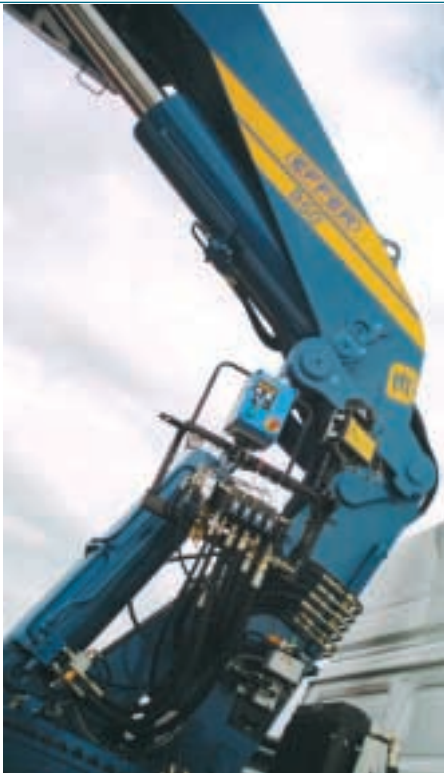
Effer says that its 100 tonne metre class model 950 is the biggest ever knuckle boom to be sold into the UK.

version joins an electric narrow version and a sub 3 tonnes electric Lite version in UpRight's now 3-strong AB38 range. The boom was joined, along with a selection from the company's existing scissor lift, trailer mount and self propelled boom lines, by the new Snappy Junior light weight, mini work platform for the tool hire and DIY markets.