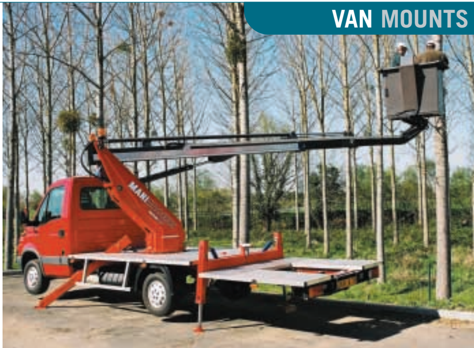
Manitou's maiden voyage into the van mount sector sets sail with the launch of the models MOB 130 and MOB 171 from its Mobile Access series. Pictured is the 17 metre working height MOB 171.

At just about this time last year, C&A reported that the vehicle mounted hire sector was 'getting very hot'. And, taking into account the scale of investment by the sector's manufacturers recently and the growing demand from end users, things are still looking good 12 months down the line.