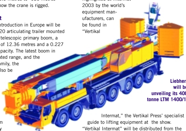
Liebherr will be unveiling its 400 tonne LTM 1400/1.

All of the above mentioned products and the many, many more, to be highlighted at Intermat 2003 by the world's equipment manufacturers, can be found in "Vertikal