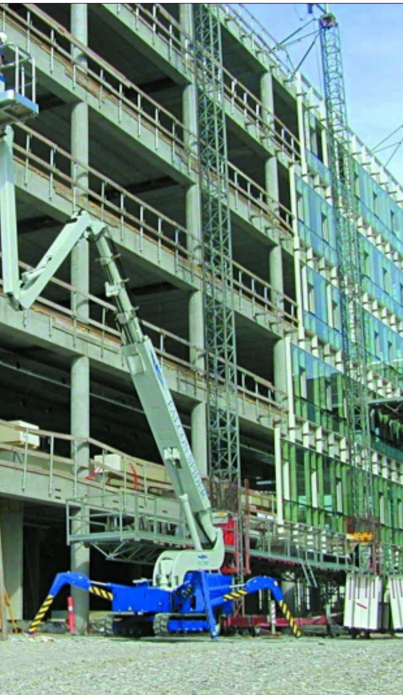
Falck Schmidt has incorporated a double link jib design into its new 29 metre working height Falcon Spider.

features a three-hole link allowing for numerous points where the track can be adjusted. For applications on finished surfaces, a soft bottom urethane track version, available on the S-40/45 only, features self-cleaning v-shaped pads. Genie says that after initial installation, the drive-on design of both track versions allows the track to be re-installed in less than 30 minutes.