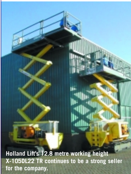
Holland Lift's 12.8 metre working height X-105DL22 TR continues to be a strong seller for the company.

E Falck Schmidt is another company that sees good potential in the crawler boom market and says that it has recently turned its attention to the outdoor market with its new crawler chassis