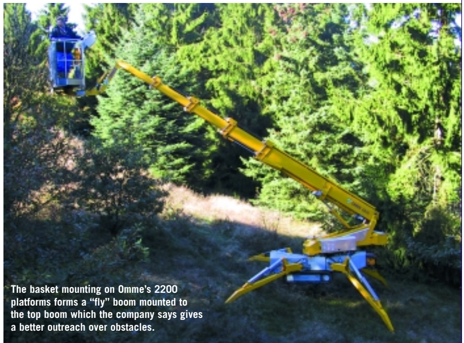
The basket mounting on Omme's 2200 platforms forms a "fly" boom mounted to the top boom which the company says gives a better outreach over obstacles.