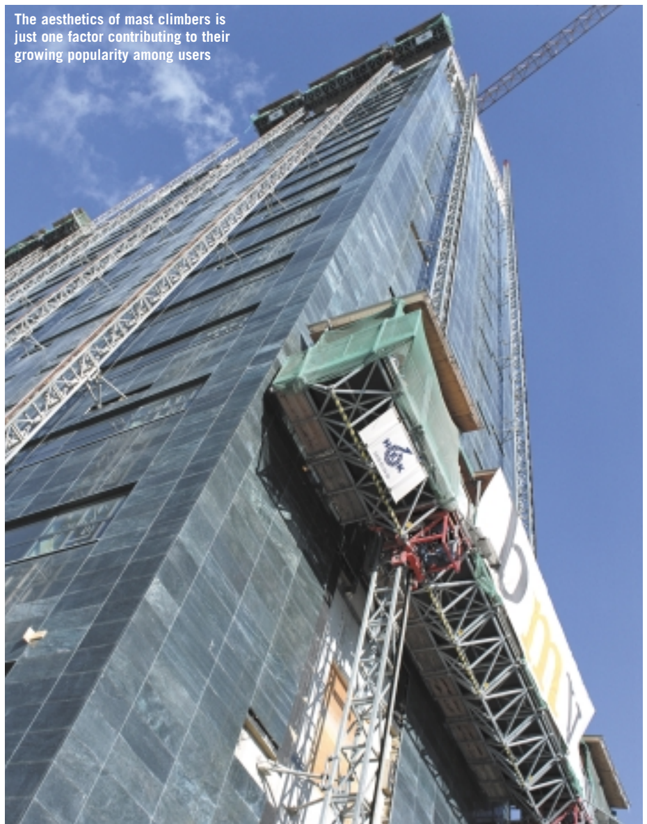
The aesthetics of mast climbers is just one factor contributing to their growing popularity among users

Haki Ltd of Tamworth is the official UK and Ireland distributor for Geda-Dechentreiter of Bavaria, one of Europe's foremost manufacturers of hoists and related products.