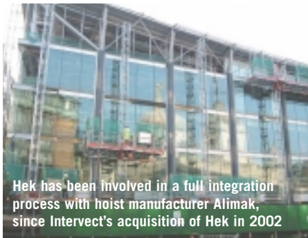
Hek has been involved in a full integration process with hoist manufacturer Alimak, since Intervec's acquisition of Hek in 2002

during renovation don't want to be staring at endless tubes, fittings and planks all day".