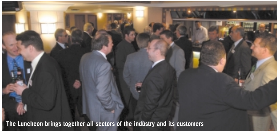
The Luncheon brings together all sectors of the industry and its customers

THE SUCCESS of last year's Safety Forum has led IPAF to organize a similar event alongside its 2003 AGM. The "Access Summit" and the 2003 AGM will be held on Tuesday 15th April at the London Heathrow Marriott Hotel. The theme of this year's Summit is 'Marketing Safety is Profitable'.