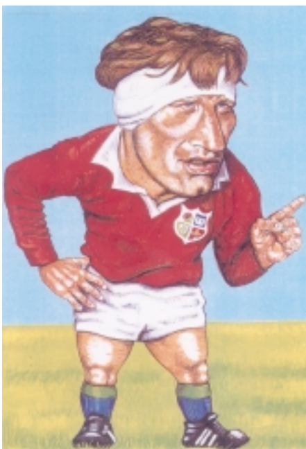
The greatest British Lion of all time? Willie John McBride will speak of his experiences on and off the rugby field