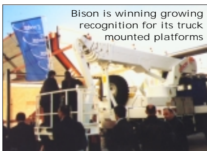
Bison is winning growing recognition for its truck mounted platforms

So it seems that Made In Germany does still have important associations. It means that there is a link with a highly experienced and educated engineering work force and that you are probably dealing with a company that will provide