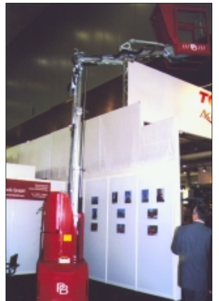
Virtually unknown outside Germany is PB's range of powered access

crane industry is now dominated by four German crane factories although all but one of them have been bought by non-German crane manufacturers. The exception is Liebherr, also the largest, which likes to see itself as the Mercedes of the crane business. Its crane designers openly aspire to hi-tech solutions and have undoubtedly "pushed the envelope" in crane design. Ehingen's 70 metre booms are technological marvels and are backed by a worldwide net-