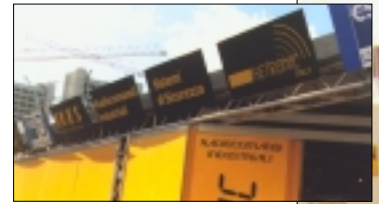
German remote control systems are in use around the world.

In the tower crane sector Liebherr leads the way in technology, but has had stiff competition from Peiner and Wolff. Potain also likes to point out that it has a German factory, the