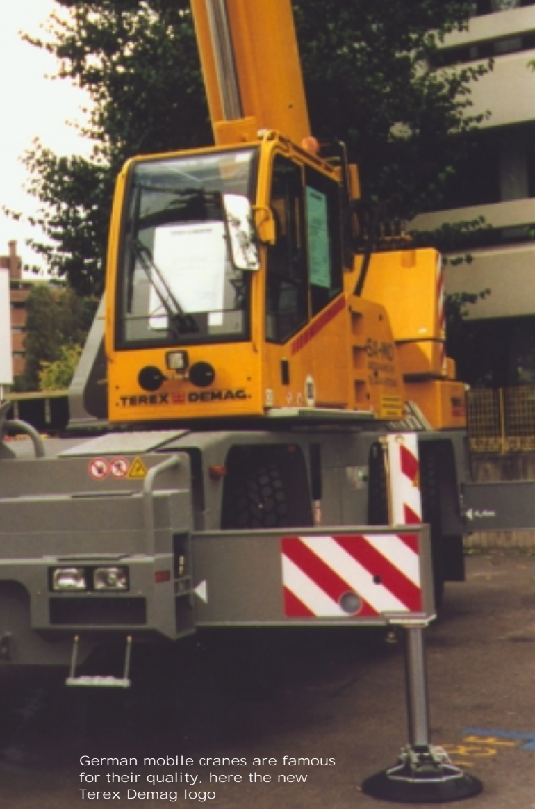
German mobile cranes are famous for their quality, here the new Terex Demag logo

former BKT factory, and that most of its large slewing cranes are “Made in Germany”.