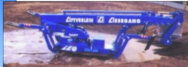
The "go-anywhere" Leo from Teupen

Looking at the products that dominate German exports to our industry it is easy to see the emphasis on engineering skills coming through. The European mobile