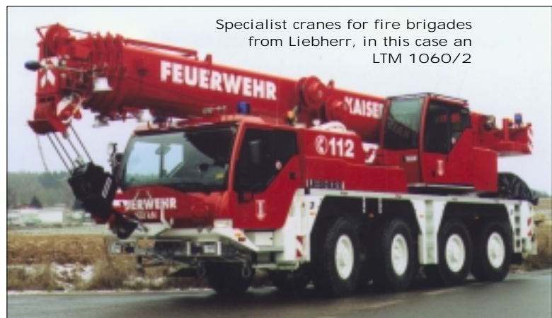
Specialist cranes for fire brigades from Liebherr, in this case an LTM 1060/2