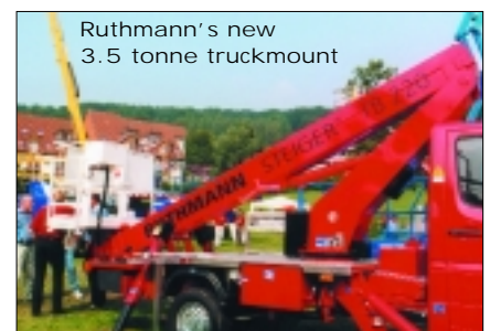
Ruthmann's new 3.5 tonne truckmount

after sales and back up. It is also likely to mean higher prices although the depressed state of the German economy means that prices are getting lower and German manufacturers will "cut a deal".