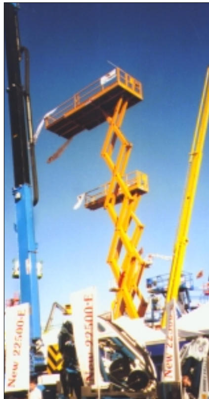
The Liftflux range is known throughout Europe

A relatively new company is Houmani Liftsystems which has developed a range of remotely accessed data monitoring systems for all types of lifting equipment. The Houmani minibox is a data recorder that