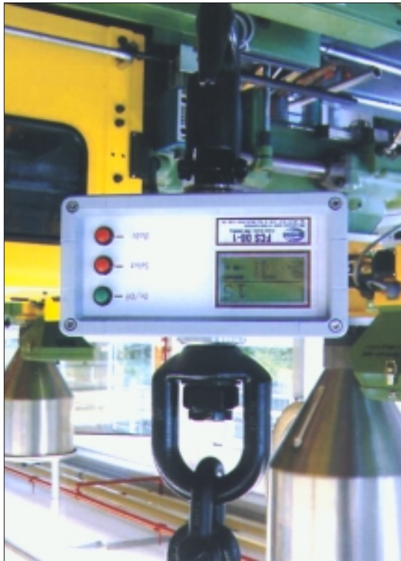
Crane Care's new HBV 'Crane-Scale' which allows up to 10 000 remote control systems to be operated per square kilometre without interference

German engineering skills also shine in some of the most technical areas such as control systems, remote control and remote monitoring. PAT dominates the market for hi-tec, in-cab crane control systems. Companies like HBC Radiomatic, which is represented by Crane Care in the UK, offers a full range of remote controls and