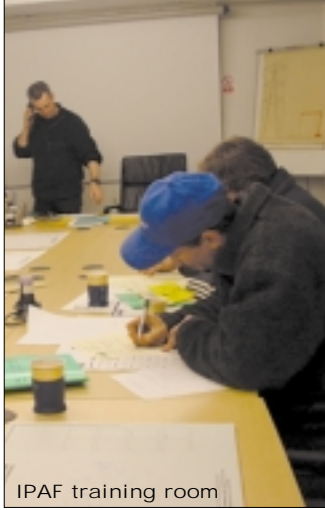
IPAF training room