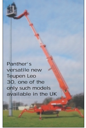
Panther's versatile new Teupen Leo 30, one of the only such models available in the UK