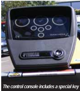
The control console includes a special key

When a company that maintains service station canopies and forecourts approached Pyroban for advice on reducing the risk of fire or explosion when working over the top or fuel pumps, the company recommended its Gascheka system, for what it calls a zone three protection level.