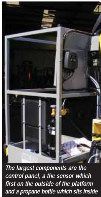
The largest components are the control panel, a the sensor which first on the outside of the platform and a propane bottle which sits inside

When the machine is operational it will give an audible and visual warning with a timed shutdown if it is ignored. The equipment is relatively easy to install and significantly less expensive than zone one or two systems, while