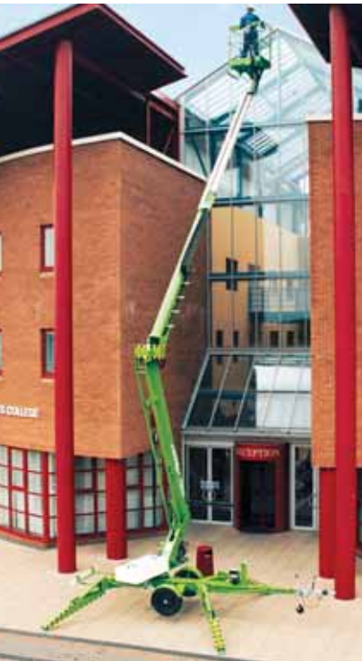
Market leader in the UK is Niftylift.

The UK market for trailer lifts has never been huge, perhaps because many see it as just a 'first step on the powered access ladder'? Traditionally, the 12 metre trailer lift has been the most popular although they go much higher with Denka claiming its DL30 - with a 30 metre working height - is the world's largest trailer mounted platform.