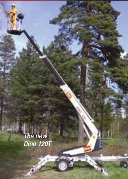
The new Dino 120T

- and they should also be innovators in their field," he said.