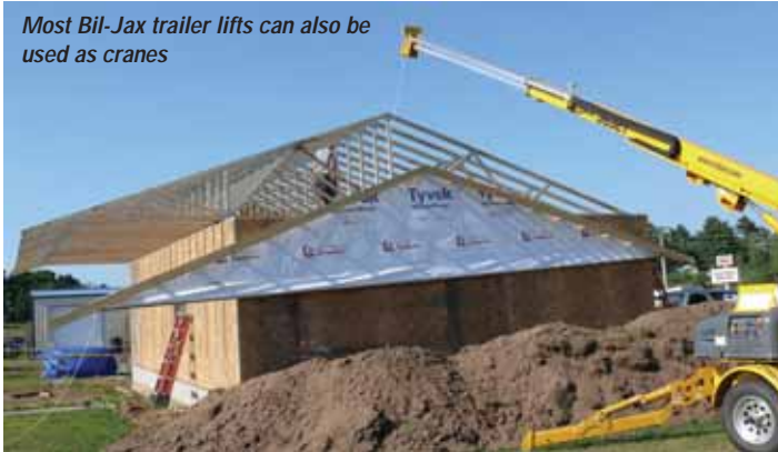
Most Bil-Jax trailer lifts can also be used as cranes

machines with a simple rugged design and full pressure hydraulic controls and available at a very competitive price! Also look out for "an innovative trailer-mounted lift that UpRight believes has real untapped potential as a global product which will help it increase its penetration of smaller equipment rental and tool hire operations."