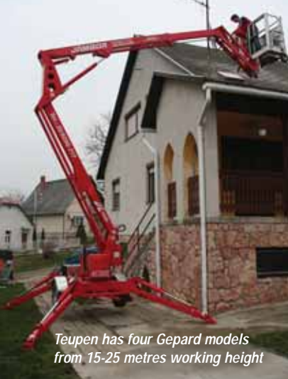
Teupen has four Gepard models from 15-25 metres working height

delivery in the UK. An added benefit is that Dino actually manufactures a large proportion of its components, including cylinders and even lock valves."