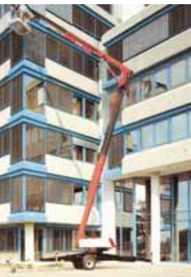
A Herkules TK20-11, the 20 metre articulated trailer lift.

Telephone +45 73561610 email: herkules@firma.tele.dk