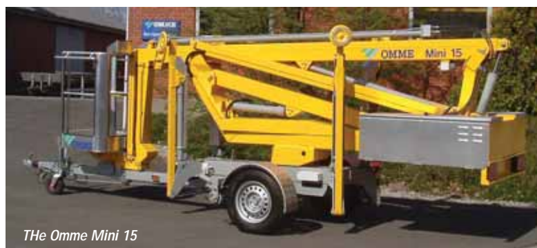
The Omme Mini 15

pick up - a lift equivalent to the mini excavator - for tasks such as gutter installation and replacement, house and office painting, antenna installation and even window cleaning. Some of this will be taken by small spider lifts and 3.5 tonne vehicle mounts, both of which have almost certainly have been taking business away from trailer lifts. However the low cost and easy towability of the trailer lift, along with greater outreach of telescopic models should translate into higher sales.