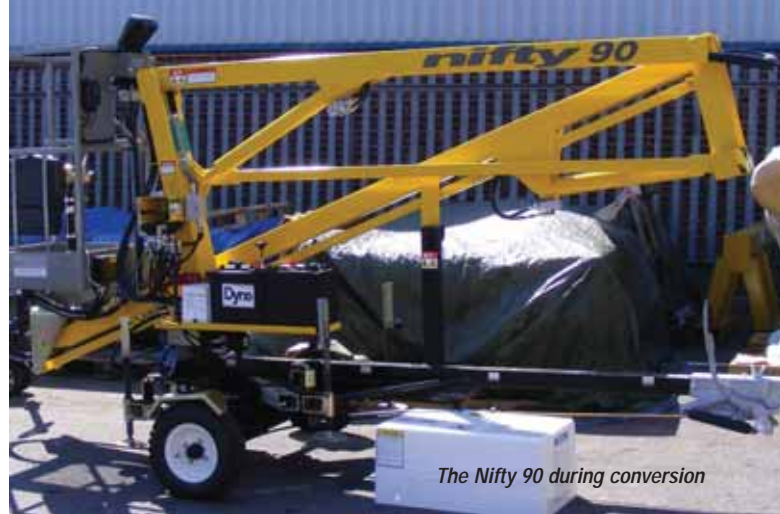
The Nifty 90 during conversion

providing significant protection. The trailers were chosen for the job due to low weight of under 600kg and compact dimensions while offering more than enough working height and outreach (3.5m).