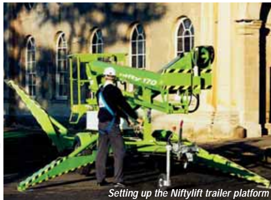
Setting up the Niftylift trailer platform

Taylor says the machine is very easy to use with buttons instead of levers which his customers seem to prefer. And with an outreach of 10 metres at six metres height the Bil-Jax can reach over conservatories and extensions and still has a basket capacity of 227kg at full outreach. "The machine has a lot of bookings in November doing Christmas lights working both day and night," says Taylor.