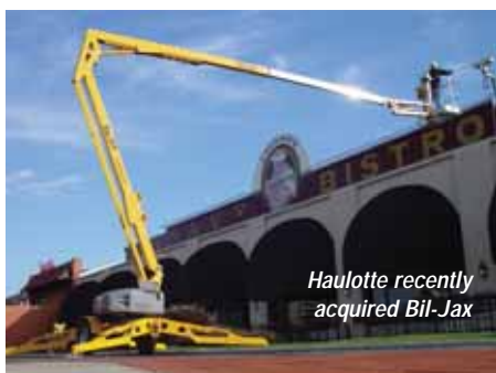
Haulotte recently acquired Bil-Jax