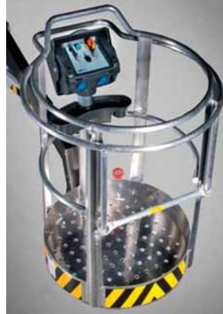
Dinolift's circular basket on the 120T.

However, in a change of distributorship, Dinolift is now being sold in the UK by The Spiderlift Company (previously Ranger Equipment) - which also sells the German-built Teupen trailer, spider and van mounted platforms. The re-branded company is also looking to distribute a third range of machines in the UK and Ireland.