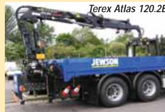
Terex Atlas 120.2E

Loader cranes were also out in force, with the largest display of loader cranes in the UK this year. The display was centered around the ALLMI area and included manufacturers including Hiab with its regional dealer Muniserve, Effer with dealer Britcom, PM teaming up with sister company Oil&Steel, Hyva, Terex-Atlas, HMF Penn Hydraulics and Fassi UK.