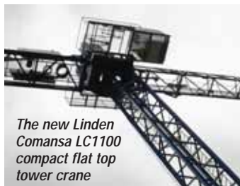
The new Linden Comansa LC1100 compact flat top tower crane

Several manufacturers used the show to launch new products and services, including Linden Comansa which shipped the first production unit of its new LC1100 compact flat top tower crane directly to the show. The crane's arrival was threatened by a truck drivers strike in Spain. However 'most' of it arrived safely and the City Lifting team made relatively short work of erecting it well in advance of the show opening.