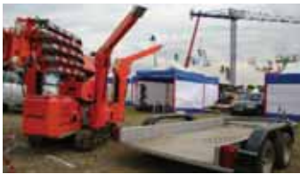
Jekko SPD500 and trailer.

Jekko UK showed off its range of spider cranes and a new lightweight trailer.