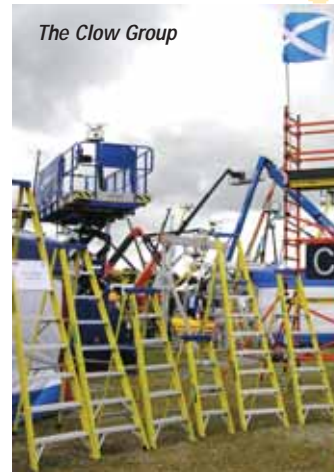
The Clow Group

Rarely seen in the UK is the largest self propelled platform from Dinolift - the 24.5 metre working height and 215kg maximum platform capacity 240RXT.