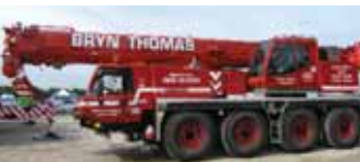
A Tadano ATF 65G-4.

Penny Hydraulics showed numerous of its compact models for mounting on vans and small trucks.