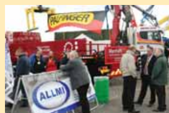
The ALLMI area was busy with one of the largest displays of lorry loaders in the UK this year

Terex chose to showcase one of its best-selling loader cranes - the five extension, 5.3-14.4 metre reach 120.2E - which is becoming the builders merchant's crane of choice. The 12 tonne/metre crane combines speed, flexibility and dependability with state-of-the-art safety features including the proven radio remote control.