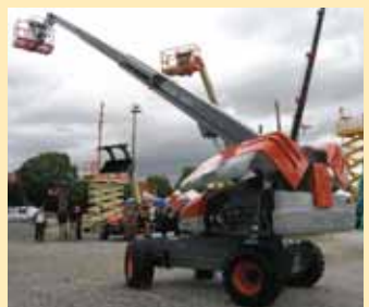
Seen for the first time at a UK show is Skyjack's SJ66T with 20.1 metre platform height and 17.4 metre of outreach.

In the self propelled sector, Skyjack showed off a number of its products including its new boom lifts - seen for the first time at a UK show - and a selection of scissor lifts. The SJ66T straight boom incorporates the company's axle-based four wheel drive system and features directional sensing drive steer control. Largest scissor on show was its 41ft SJ9241 with dual-powered platform extensions giving a total length of 7.3 metres.