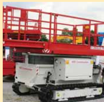
Another winner for Holland Lift? Not a popular concept in the UK but interest is on the increase.

Holland Lift displayed a 10.5 metre working height crawler mounted scissor lift with a 1.4 metre platform extension. Although not a popular concept in the UK, distributor Russon Access reports a couple of sales and increased interest at the show.