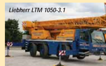
Liebherr LTM 1050-3.1

One of two 61 metre truck mounted platforms was this Wumag WT610 on the Skyking stand.