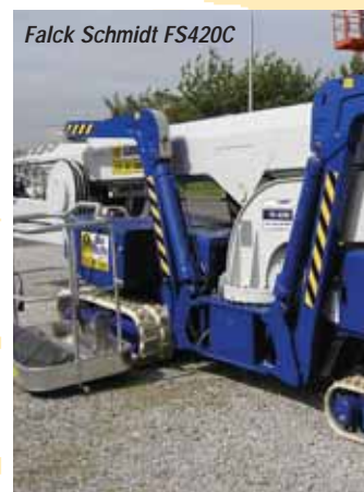
Falck Schmidt FS420C

The Clow Group put on an impressive display including the adjustable Magic platform, the Folscaf one-piece folding platform and its new 3T fibreglass tower system.