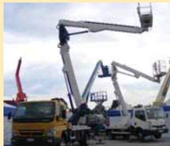
The recently launched 27 metre Multitel MX270 with the newly introduced MX170 in the background

Pagliero showed its recently launched 27 metre MX270 articulated telescopic truck mounted lift which tops out the highly popular MX range.