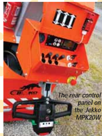
The rear control panel on the Jekko MPK20W

The first units are scheduled for delivery in September and features an end boom quick release which can take hook and pulley system as well as pallet forks.