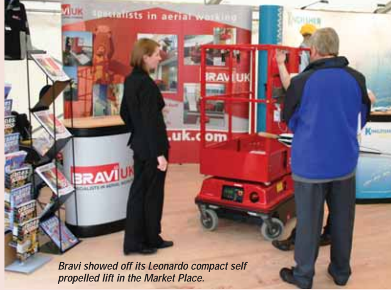
Bravi showed off its Leonardo compact self propelled lift in the Market Place.

French-based crane electronics safety specialist AGS showed its latest crane 'anti-collision' management system. The company is making headway in the UK and currently has its largest system working - 15 cranes