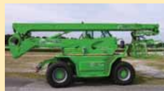
The high-speed Merlo MPR access platform is based on the proven Roto telehandler combining 40 km per hour travel speed with a platform working height of up to 30 metres.

Telehandlers were out in force this year with product from JLG, Genie, Manitou, Merlo, Liebherr, Sennebogen and Haulotte with its new 14 metre HTL 4014 telehandler which is now available in the UK. Merlo also had one of its prototype Platform MPR30 models on display for customers to evaluate.