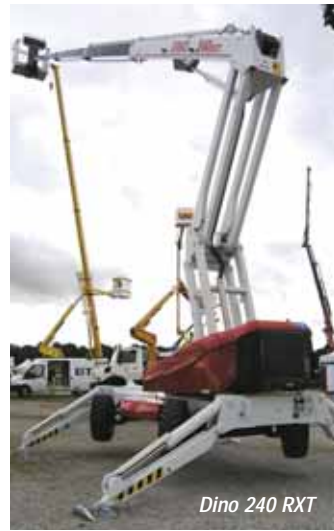
Dino 240 RXT

Promax took several orders at the show for its Bil-Jax trailer and self propelled lift units. Since the show Haulotte has acquired Bil-Jax and no information is yet available on future distribution.