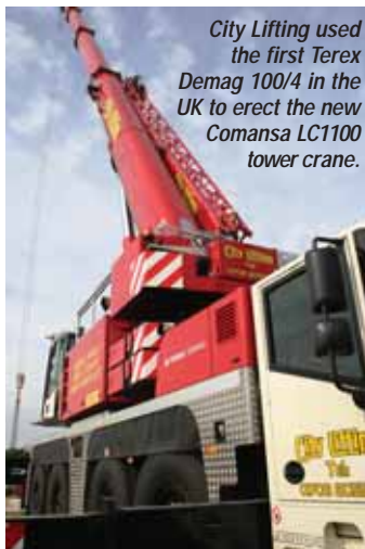
City Lifting used the first Terex Demag 100/4 in the UK to erect the new Comansa LC1100 tower crane.

A new cab position also provides a greater field of vision for the operator and 2.5 metre long jib sections increase the range and load combination possibilities.