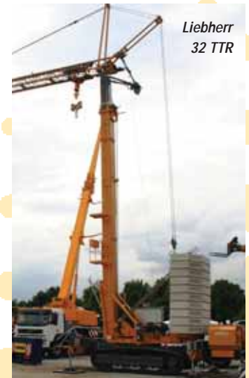
Liebherr 32 TTR

CTE UK had several machines including the Z26E platform.