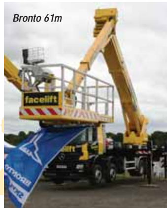
Seen for the first time, the 61metre working height, 37 metre working outreach Bronto X61XDT in Facelift colours.

On the access side, Bronto showed several truck mounted platforms and unveiled its new, three axle, 61 metre working height X61XDT with 37 metres of outreach and 700kg lift capacity. The 12 metre long unit has a 32 tonne GVW.