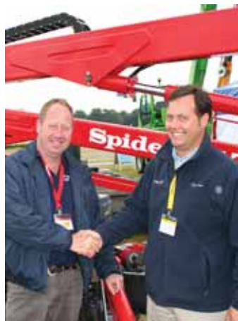
First Platform Basket sale.

Avant Techno builds the Leguan range of skid steer based and crawler mounted lightweight self propelled boom lifts. At the show was the Leguan 125 spider and the skid steer based 80SX scissor