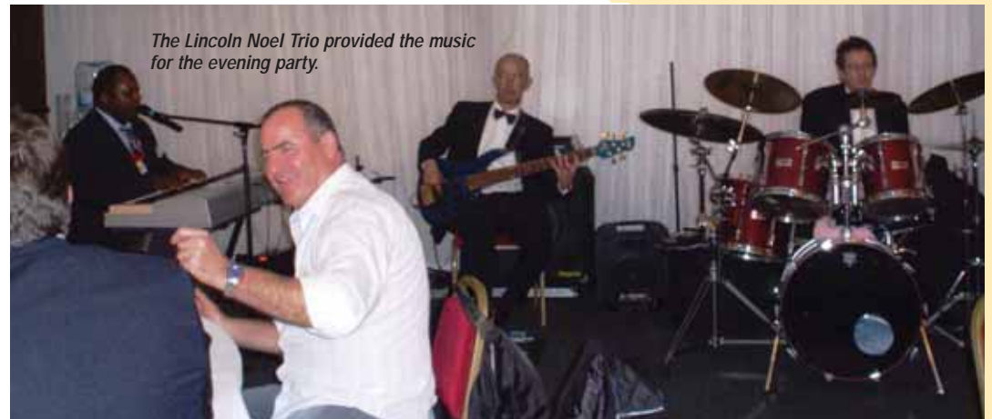
The Lincoln Noel Trio provided the music for the evening party.

The well-attended party on the evening of the Day One included a table by table, silent auction of crane, access and telehandler scale models donated by dealers and manufacturers. A big thank-you to all who bid as more than £500 was raised for the Lighthouse Club.