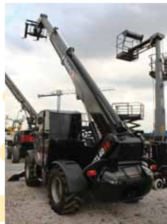
Haulotte's new H28TJ+ is attracting interest from the major platform rental companies.

Haulotte showed off its new 28.2 metre working height boom with telescopic jib the H28TJ+. Unveiled at Conexpo earlier this year, the company is reporting wide interest in what is a hybrid concept which features a six metre telescopic jib for additional outreach and 'up and over' capability. Maximum basket capacity is a useful 350kg as is the 22.6 metre horizontal outreach.