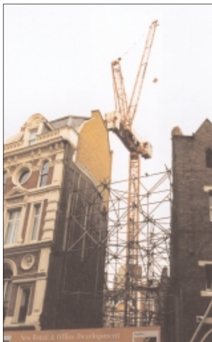
A Raimondi LR60 from Vanson Cranes working for Sindall at Long Acre. Slim 1.2 metre x 1.2 metre tower sections are a feature of this crane

or on the roofs of buildings while refurbishment is being performed or additional floors are being added. Maximum radius of the S-46 is 30 metres while the maximum capacity of the small crane is limited to 2.2 tonnes.