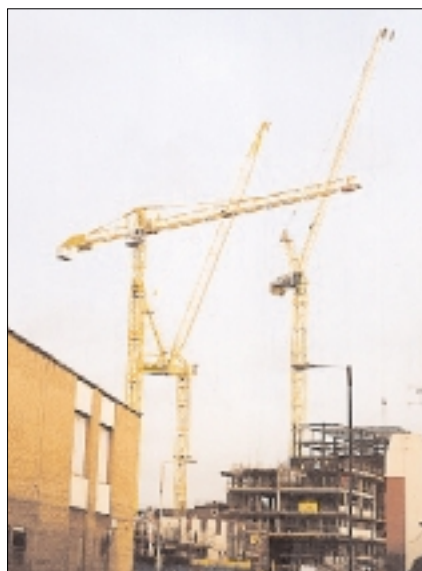
Falcon Crane Hire has installed a new Jaso J 138 PA luffing jib along with a Potain MR150 luffer and a BPR saddle jib at Imbert Street

Two veterans with outstanding design features are the Tornborgs Magni S-40 and S-46. These unusual cranes are in use throughout central London where the articulating joint half way along the boom makes them ideal for working close in under other cranes. These lightweight cranes are sometimes installed in lift shafts