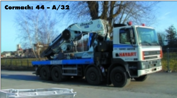
Cormach: 44 - A/32