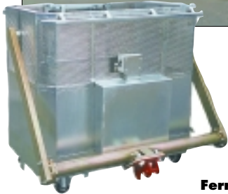
Ferrari International 2: 44 - C/19