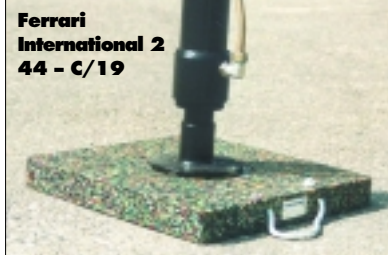
Ferrari International 2 44 - C/19