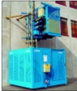
Maber: 42 - B/49