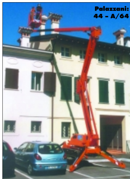
Palazzani: 44 - A/64

Palfinger has a full range of loader cranes including the 50 tonne class PK 56002 and the PK 72002 which has a lifting moment of 68 tonnes and a