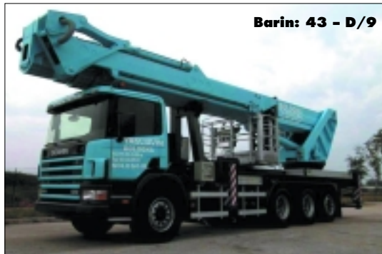
Barin: 43 - D/9

Imet will launch the Micron 80, a palm size remote control and the Z6 which is designed for use with loader cranes.