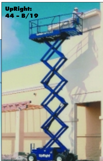
UpRight: 44 - B/19