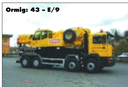
Ormig: 43 - E/9