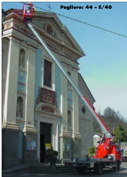
Pagliero: 44 - E/40

suitable for use on small cranes. GSR is launching a 22 metre platform height unit on a 7.5 tonne truck. This is the 3000th machine to have been built by GSR and it will be handed over to Gordon Leicester of Facelift during the show. Also on show is a prototype 28 metre platform on a 7.5 tonnes truck. ▶