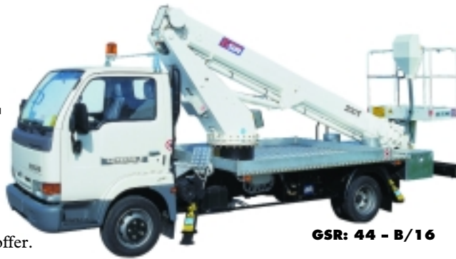
GSR: 44 - B/16

Ferrari International 2 is showing stabiliser blocks for use under outriggers and a new personnel basket, "Fab 1",