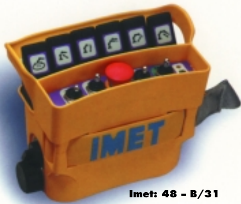
Imet: 48 - B/31