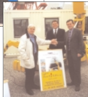
EasiUpLifts announced a variety of purchases

New from Snorkel is the SJIII 3226. This electric scissor is designed to fit ▶