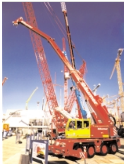
A luffing jib featured on Demag's AC60

"bauma land" is what the local radio station called the outdoor area of bauma and it was a sight/site you'll never forget. "Somewhere between a construction industry Disneyland and the fantastic dream site of a lunatic civil engineer" is how one visitor described the view to Cranes & Access