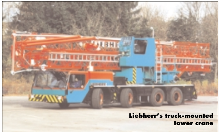
Liebherr's truck-mounted tower crane

So what drew the 390,000 people, 28 per cent of whom came from outside Germany? Well, there were 2,341 exhibitors on 445,000 square metres of exhibition space and it was a great opportunity to catch up on everything that's new in the construction industry.