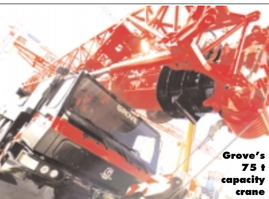
Grove's 75 t capacity crane

Bauma 2001 was the largest single collection of construction equipment ever assembled anywhere in the world. Cranes & Access reports from the thick of it