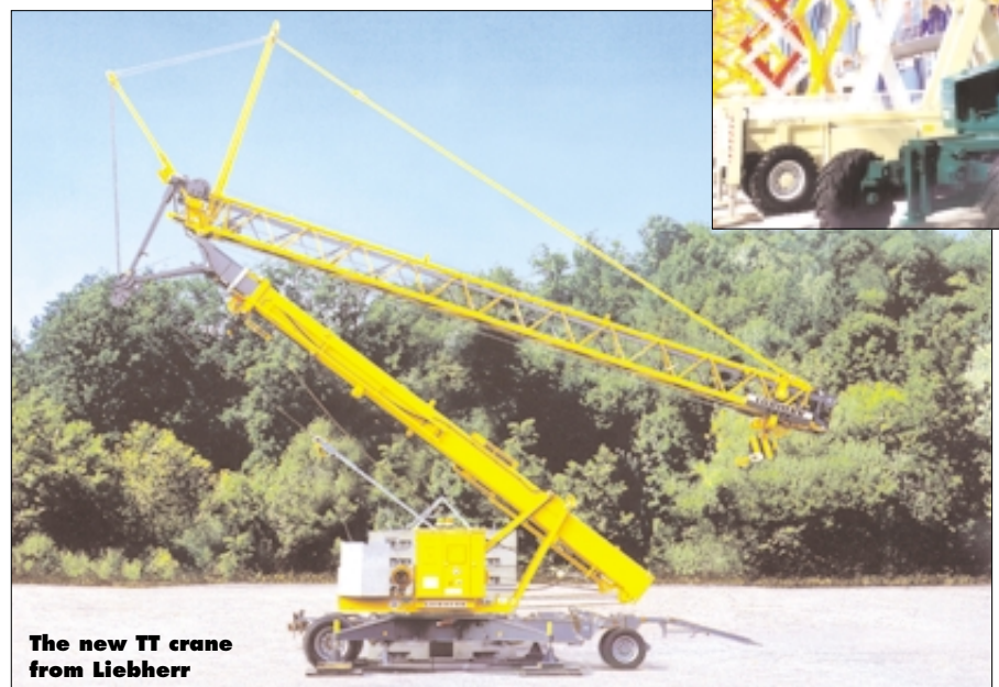
The new TT crane from Liebherr