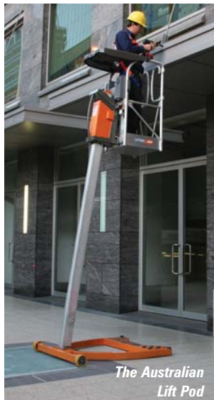
The Australian Lift Pod

The first unit - the LiftPod Model FS80 - features a 600mm x 500mm work platform with a low platform entry height, single-hand interlocked control and proportional lift and descent.