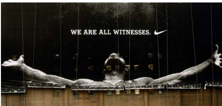
The Spider division of SafeWorks recently used seven suspended platforms to take down the huge 10 storey Nike banner advert in Cleveland.