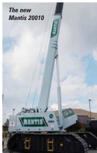
The new Mantis 20010

The new crane incorporates many of the features introduced on its 100 ton re-railing crawler crane, the 200RS, such as a full pick and carry load chart, heavy duty drive gear and higher than usual ground clearance.