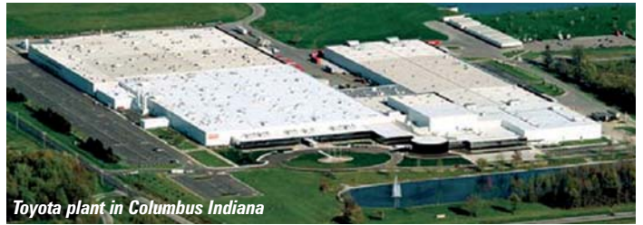
Toyota plant in Columbus Indiana

Japanese market leader Aichi is to open a production facility in Columbus, Indiana, near to the Toyota fork truck facility. The plant will produce up to 10 models from the company's boom and scissor lift ranges by the end of 2008. As part of this expansion the company says that it will also expand its North American sales and support team in Baltimore. The move is part of the company's plans to boost sales by 25 percent to