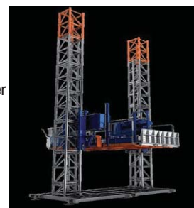
The new Hek Modular system combines three mast sizes with standard base and drive platform

The new system introduces three main components, a base unit, drive unit and mast. Three different masts are available for Light, Medium or Heavy applications in work or transport platform mode. An Alimak personnel hoist can also run on the same masts. The new system will provide rental companies with significantly greater capability from smaller inventories, while boosting production efficiencies for the manufacturer.