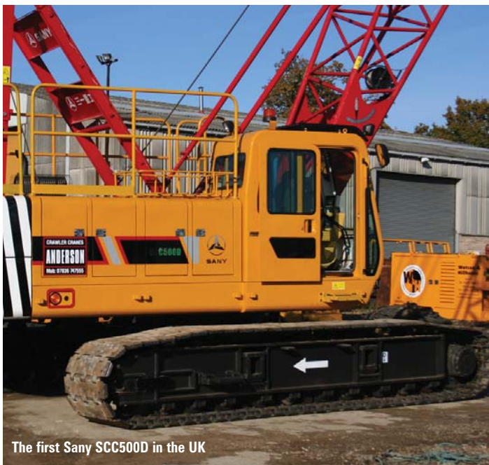
The first Sany SCC500D in the UK

(See Page 58 for an interview with new dealer Watson & Hillhouse)