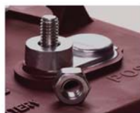
Durable embedded terminals