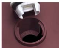
Precise maximum water level indicator