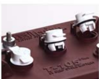
Convenient SureVent™ flip-top caps

Trojan's Plus Series offers the same premium performance you have come to expect from Trojan, plus the added features you asked for.