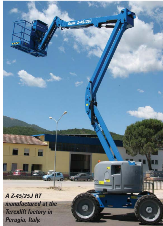
A Z-45/25J RT manufactured at the Terexlift factory in Perugia, Italy.