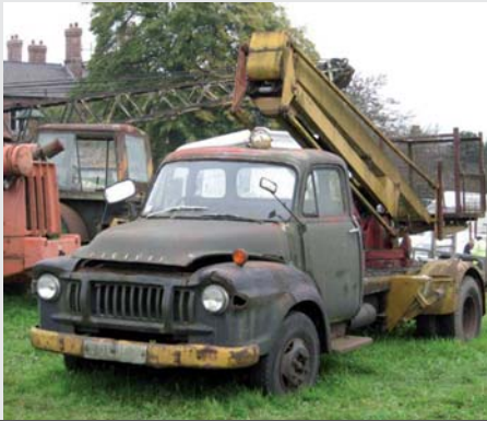
This truck mounted platform was sold recently on ebay for £2,300.

No matter what you think regarding the morality of selling old, inoperable or possibly dangerous machines to the public, there is no argument that prices obtained for the oldest aerial lifts is often surprisingly high.