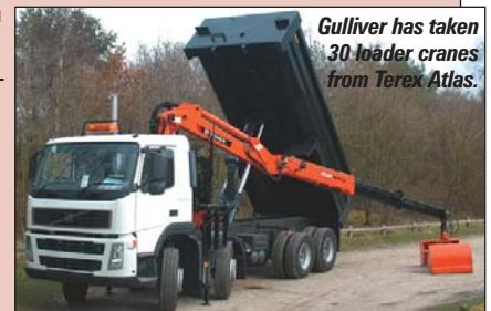
Gulliver has taken 30 loader cranes from Terex Atlas.

and catwalks. They will join the 30, 118.2 VGL single telescopic cranes supplied in 2006.