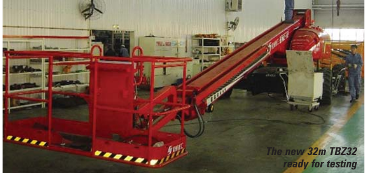
The new 32m TBZ32 ready for testing

The company also has three new electric scissor lifts with working heights between eight and 10 metres, undergoing CE approval. JCHI will exhibit at APEX 2008 where at least four machines will be displayed. The next project is a line of four wheel drive diesel scissor lifts with working heights of 10, 12 and 14 metres.