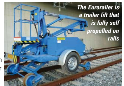
The Eurorailer is a trailer lift that is fully self propelled on rails

The Eurorailer has an eight metre platform height, 120kg lift platform capacity, 3.5 metre outreach and weighs just 1,500kg. Powered by a Kubota diesel engine, it has a track speed when stowed of 15kph reducing to 3kph when elevated. The machine has been approved by HCC-DRS, the experts on rail-infrastructure equipment and is equipped with a license plate for road transport.